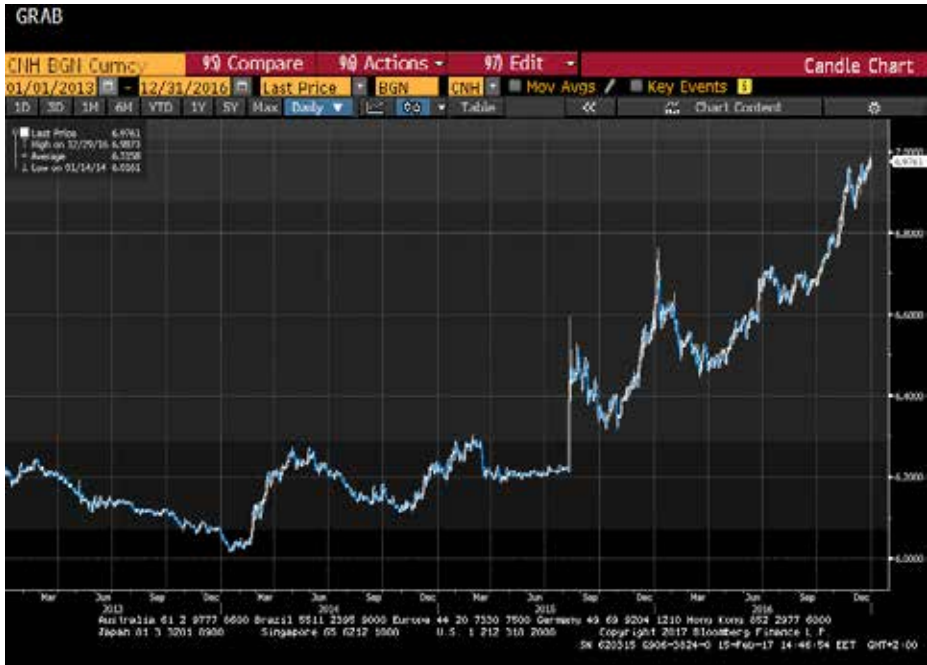
Chart 3. USD/CNH (Yuan offshore): January 2013–December 2016 Source: CNH Currency (GO), Bloomberg [access 14.02.2017]

The idea of creating the Chinese Yuan offshore market (CNH) and the pressure to achieve reserve-currency status by the Yuan onshore market (CNY) smack of marketing activities rather than a step towards financial development due to the Chinese currency’s lack of full convertibility.