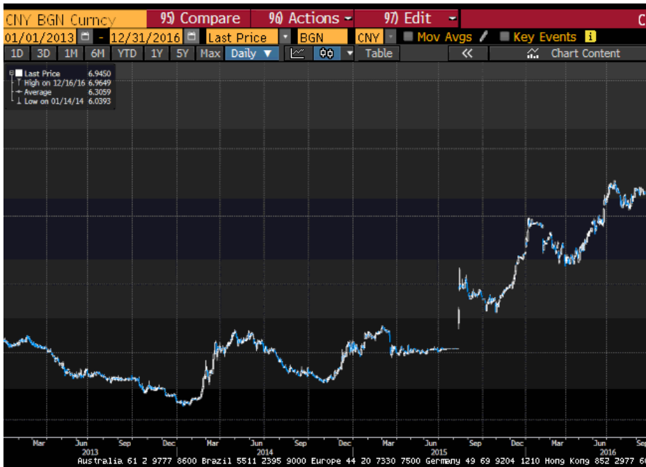
Chart 2. USD/CNY (juan on shore): January 2013–December 2016 Source: CNY Currency [GO], Bloomberg [access 14.02.2017]