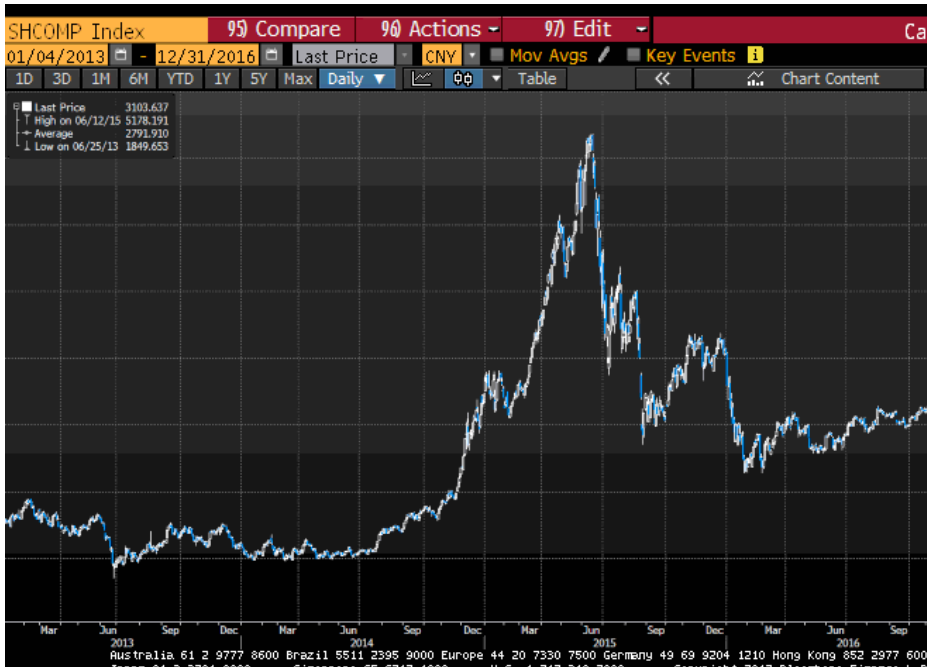
Chart 1. Shanghai Index Quotation: January 2013–December 2016 Source: SHCOMP Equity [Go], Bloomberg [access 14.02.2017]

The Chinese domestic financial system consists of a wide range of financial markets such as: the FX market (including CNY FX spot, FX forward and FX swaps transactions), the credit market (based on SHIBOR quotations), bond market and stock exchanges. Such an infrastructure is typical for the capital economy where the prices of financial instruments and assets are prone to volatile and rapid changes caused by economic data or politics, despite the will and expectations of CPC leaders. In the summer of 2015, a 30% drop of equity prices triggered CSRC action to freeze prices for half a year despite the fact that more than 80% of equity belonged to individual investors (China Daily/Reuters).