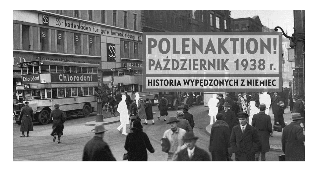
Fig. 5. Poster from the exhibition devoted to the expulsion of Polish Jews from Germany in October 1938

Emanuel Ringelblum, the patron of the Jewish Historical Institute, joined in helping those in Zbąszyń. He participated in a huge aid and logistics project, organised mainly by charitable institutions, including the Polish Red Cross. "By also gathering the accounts of the exiles, Ringelblum gained experience which proved crucial in his organisation of the Underground Archive of the Warsaw Ghetto – the most important collection of our Institute", said the curator of the exhibition<sup>6</sup>. The camp in Zbąszyń was closed down in August 1939, just before the outbreak of the Second World War.