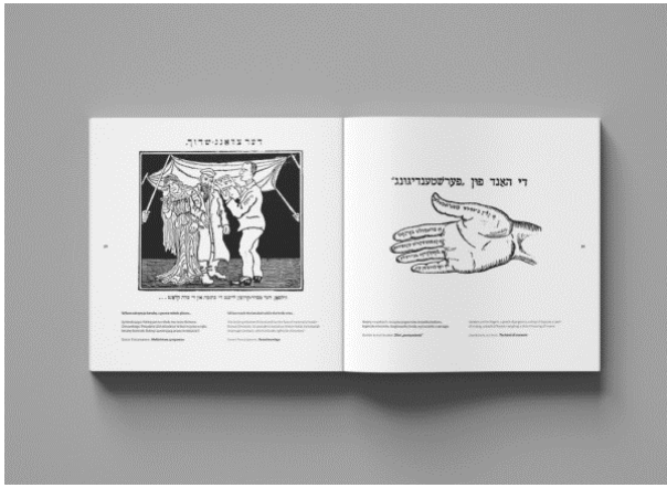
Fig. 2–3. The Wolny Ptak/Der Frajer Fojgl. Humor z prasy żydowskiej w Polsce niepodleglej album, edited by Agnieszka Żółkiewska (Warsaw, 2019).