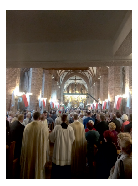
Fig. 13. August celebrations in Gdańsk. Liturgy of mass in the church St. Bridget, August 31, 2018