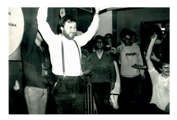
Fig. 6. Students during the 1988 strike. University of Gdańsk building, Wit Stwosz street 51

registration of its Plant Commissions. However, the authorities slowed down the registration process, which exacerbated public frustration caused by earlier price increases. The effect of those events was a wave of so-called spring strikes that spread all over Poland. In addition to workers, students were also involved in the protests. It is worth emphasising that they were peaceful demonstrations. On May 1, 1988, they were organised on an unprecedented scale since the lifting of martial law in 1983. The next day, a strike broke out in the Gdańsk Shipyard and the Strike Committee demanded registration of "Solidarity". On May 3, Tadeusz Mazowiecki and Andrzej Wielowieyski came to the shipyard with a representative of the Episcopate. Their dialogue with the shipyard management did not bring any results. The shipyard workers' protest was supported by street demonstrations and an occupation strike by Tri-City students (Fig. 6, 7, 8, 9): students of the University of Gdańsk, University of Technology and the State College of Fine Arts.