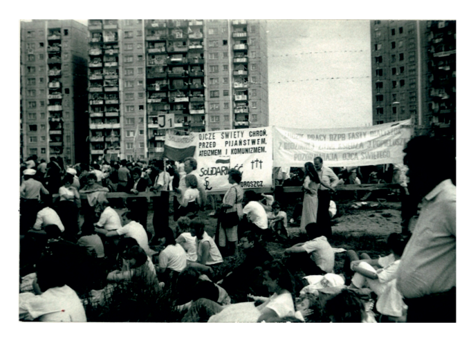
Fig. 4. Gdańsk Zaspa, June 12<sup>th</sup>, 1987. In anticipation of the Holy Mass, attended by about one million pilgrims

The Pope's appeal for the renewal of the face of "this land" was all too legible and found its way to the right ground. The "Solidarity" people understood the intentions of the Pope who in his words strengthened their actions and ideas aimed at improving working conditions and everyday life, but above all, abolishing the Soviet regime and regaining constitutional rights. John Paul II was loved by millions. Crowds came to the masses he celebrated during his pilgrimage to Poland. These meetings were also an opportunity for the society to manifest disagreement to the policy of the communist authorities (Fig. 4, 5).