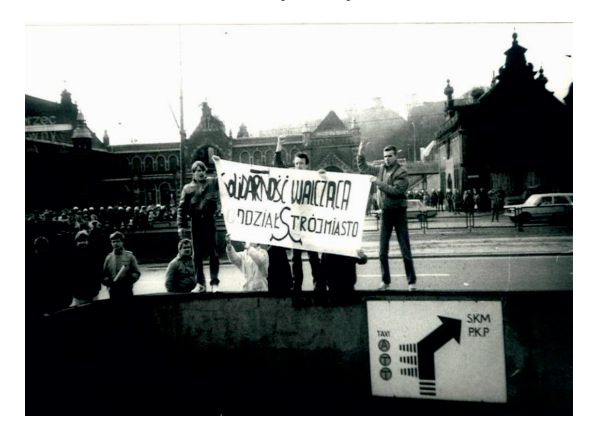
Fig. 9. Students' manifestation in the streets of Gdańsk, 1988. Main train station

The 1988 strikes lasted until September. Their nationwide dimension and scale made the PRL authorities aware that they are not able to stop social and political change in the country. The negotiations of the Round Table (lasting from February 6<sup>th</sup> till April 5<sup>th</sup>, 1989) proved that a peaceful agreement between the communist authorities and the opposition is possible. One of the leading figures participating in those deliberations and the signing of the August Agreements was Lech Wałęsa – currently judged as a controversial figure, secret collaborator Bolek, a person involved in cooperation with the Security Service. However, in that reality, at this crucial moment in the history of the Polish state, the Round Table was of fundamental importance, as in June of that year it led to partially free parliamentary elections and the establishment of a government led by Solidarity. In 1990, Lech Wałęsa ran for the office of the President (Fig. 10) and after the victory he became the first-ever President of the Republic of Poland elected in general elections.