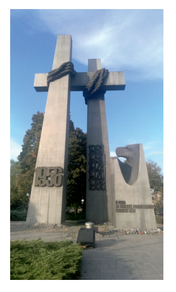
Fig. 14. Monument to the Victims of Poznań June '56