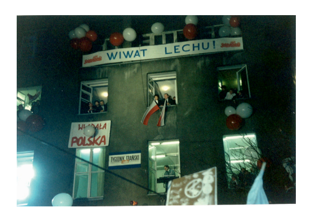
Fig. 10. After the election results are announced. Gdańsk 1990

The model of Solidarity movement was followed by representatives of democratic movements in other countries of the Eastern Bloc – Hungary, Germany and the Czech Republic<sup>6</sup>. The transformations in these states took place on the basis of the ideals of a peaceful struggle for freedom, which spread and settled down through the victory of Solidarity.