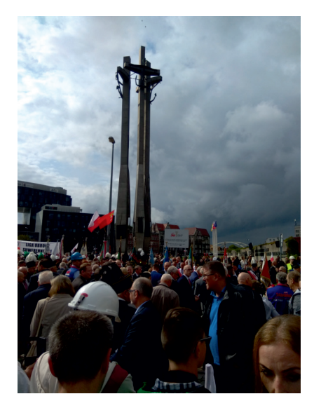
Fig. 12. August celebrations in Gdańsk in front of the second gate and at the Monument to the Fallen Shipyard Workers in December 1970