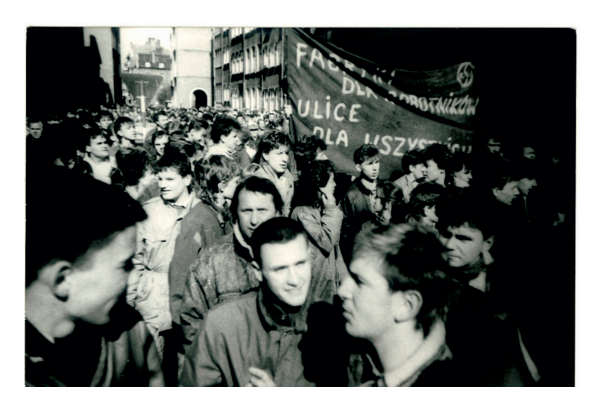
Fig. 7. Students' manifestation in the streets of Gdańsk, 1988