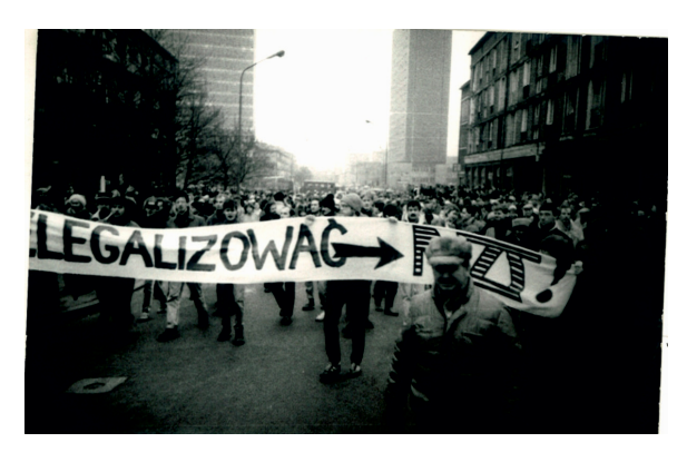
Fig. 8. Students' manifestation in the streets of Gdańsk, 1988