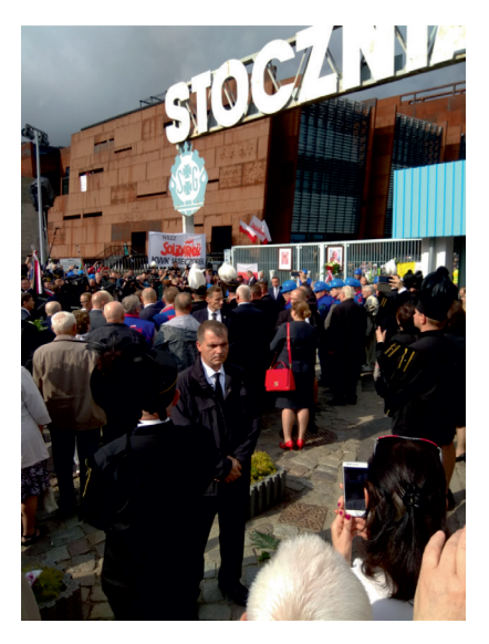
Fig. 11. After laying flowers in front of the second gate by the President of the Republic of Poland, Andrzej Duda (August 31, 2018)