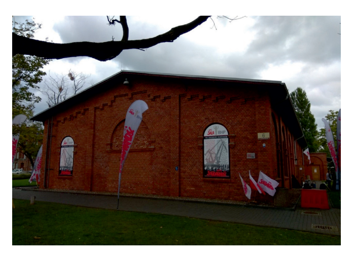
Fig. 1. EHS Hall of the Gdańsk Shipyard. August 31, 2018