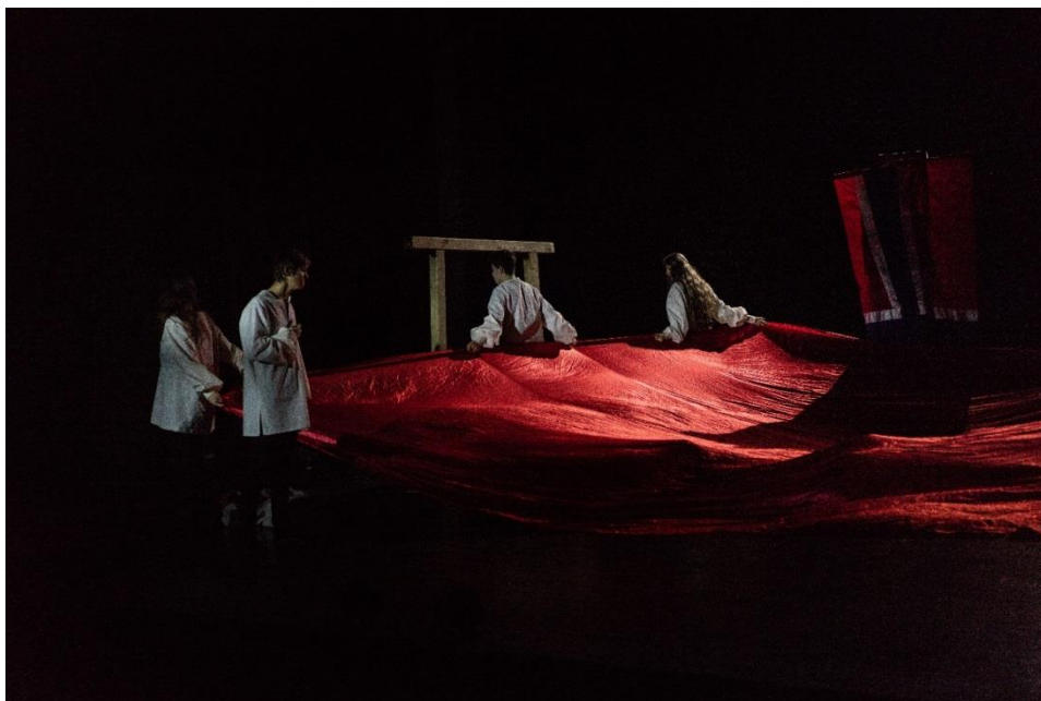
Figure 1. Hamlet (2018), directed by Dana Trifan Enache: final scene