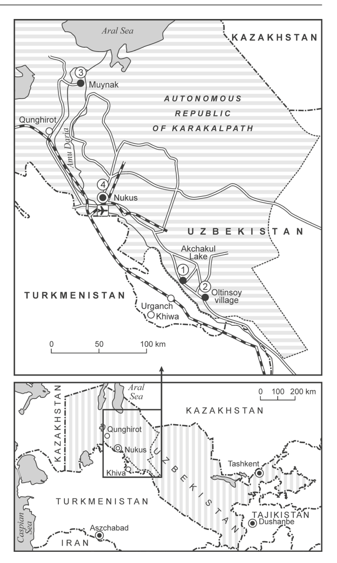
Figure 1. Small Tourist Zones in Aral Sea basin.

1. So, in STZ tourists can go to Akchakul Lake, located on the Amu Darya coast in the Ellikkala district, which has a high potential for the development of