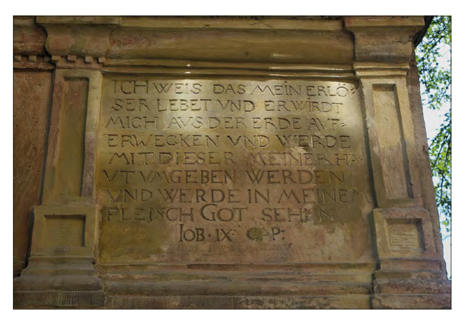
Fig. 4. Quote from the Bible, Job 19,25–27; on the cemetery gate (1542) in Eisfeld (Thuringia) (prepared by Forschungsstelle Gruft, Lübeck).