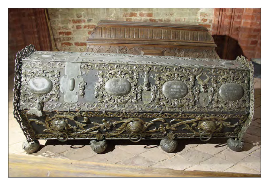
Fig. 3. Coffin of Ottilia Elisabeth von Bismarck (deceased 1695) in the Wunderblutkirche ("Miracle Blood Church") in Bad Wilsnack (Brandenburg) (prepared by Forschungsstelle Gruft, Lübeck).

cared for. Their funeral wreaths are among the most conspicuous and frequent burial objects (Fig. 2). They were given to unmarried deceased persons of both sexes and both confessions, Catholic as well as Protestant, regardless of the individual's age, as a substitute for a wedding that had not taken place in life or for a "heavenly wedding". These fragile structures of mostly non-ferrous metal wires, sequins as well as fabric or paper blossoms are mainly documented for the 17<sup>th</sup> and 18<sup>th</sup> centuries.