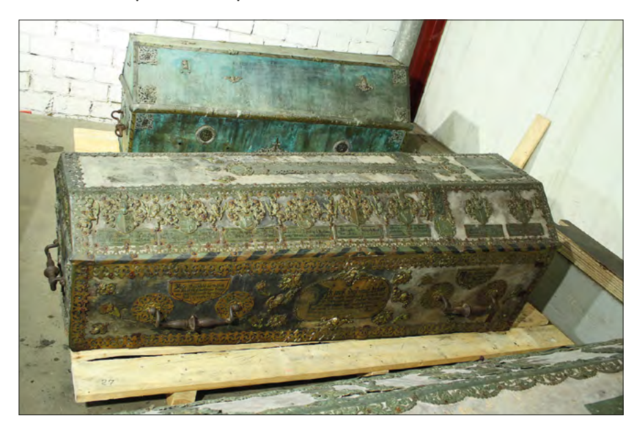
Fig. 1. Coffin of Augusta von Rantzau (deceased 1667) with proof of ancestry in Dänischenhagen near Kiel (Schleswig-Holstein) (prepared by Forschungsstelle Gruft, Lübeck).

by the reunification of all family members at the grave. "Ancestor samples", i.e. proofs of ancestry with a large number of coats of arms, were used to prove the famous origin and the importance of each individual of that very family (Fig. 1). The building of such a family tomb secured the memoria , more precisely the honourable memory of the family members for future times.