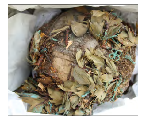
Fig. 2. Funeral wreath of the von Bünau family vault in Burkhardswalde near Pirna (Saxonia), 17<sup>th</sup> century (prepared by Forschungsstelle Gruft, Lübeck).

Medieval and early modern society in Europe was strongly interwoven with religious and moral backgrounds. Consequently, the concern for the dead as one of the Seven Works of Mercy according to the catechetical tradition of the Church is central. Even the youngest deceased individuals are lovingly