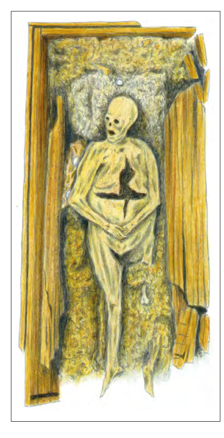
Fig. 7. Mummy of Caroline von der Wense (deceased 1838) in Lüneburg with cross-shaped section cuts (prepared by Forschungsstelle Gruft, Lübeck).

Then the question arises whether the preservation of the bodies in the tombs was intended. In general, organic materials inside crypts are preserved if these are well ventilated (Fig. 5 and 6). This circumstance has led to the fact that in European tombs there are hundreds of naturally mummified individuals; and only 100 years ago there were probably thousands. If ventilation is interrupted, the corpses disintegrate. Many of the mummies have been damaged or are now completely