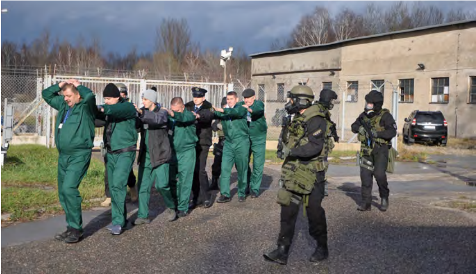
Figure 1. March of arrested people assisted by BOA KGP officers to the place of initial decontamination

The scenario of the episode played in NCBJ assumed the invasion of an armed group of terrorists on the premises of the institute. The service of the facility, which was to constitute a bargaining chip for unknown perpetrators of the offense, was captured. Immediately after the incident was noticed by the patrol of the internal security service, the response procedures provided for such a circumstance were activated. Thanks to that, only a few minutes after the notification, specialized services arrived: the Police, the State Fire Service and the locally based Radioactive Waste Utilization Plant.