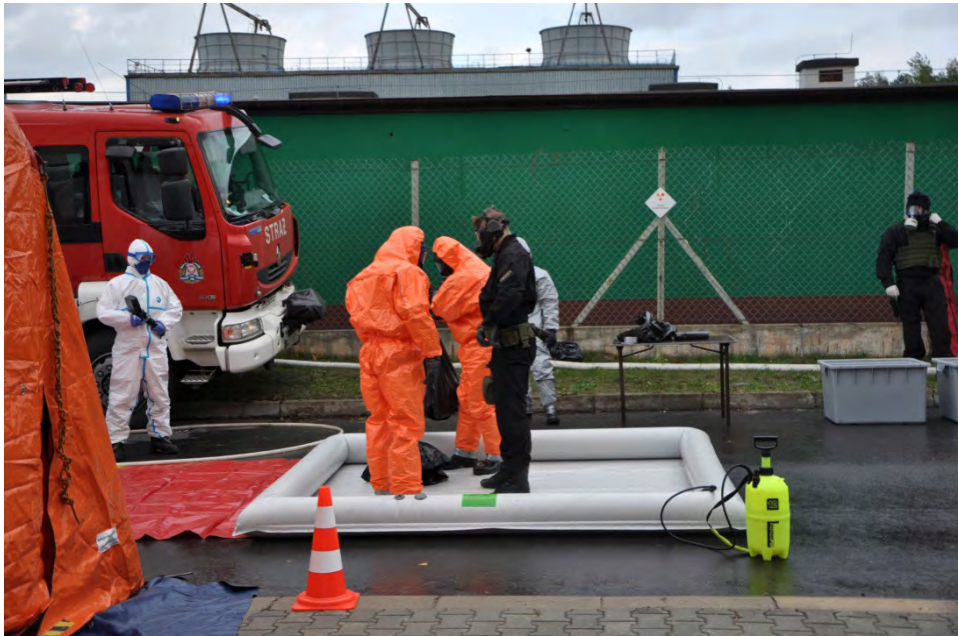
Figure 3. The initial decontamination process under the supervision of the officers of the BOA KGP

hostages and perpetrators of the crime. With particular emphasis on tactics that allow continuous surveillance during its operations over detainees (Fig. 3). An important element was the organization of security for contaminated firearms and specialized equipment of officers carrying out anti-terrorist tasks.