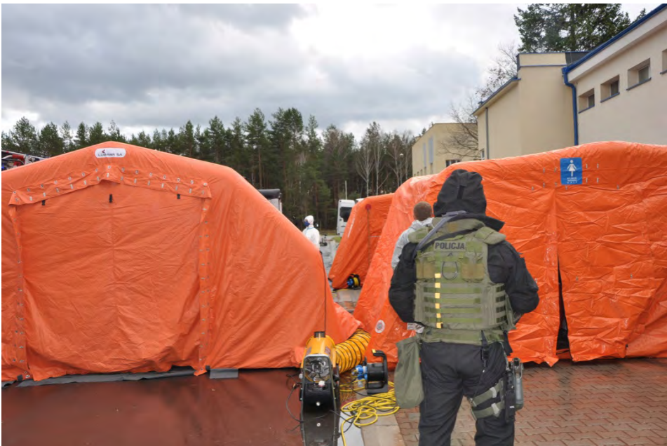
Figure 2. The securing decontamination tents by the officers of the BOA KGP

The initial decontamination was installed by the State Fire Brigade, which had arrived in place, in a configuration enabling safe decontamination of officers,