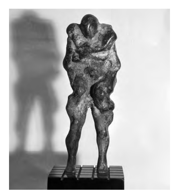
Phot. 1 Zbigniew Władyka, Dwoisty (Dual)