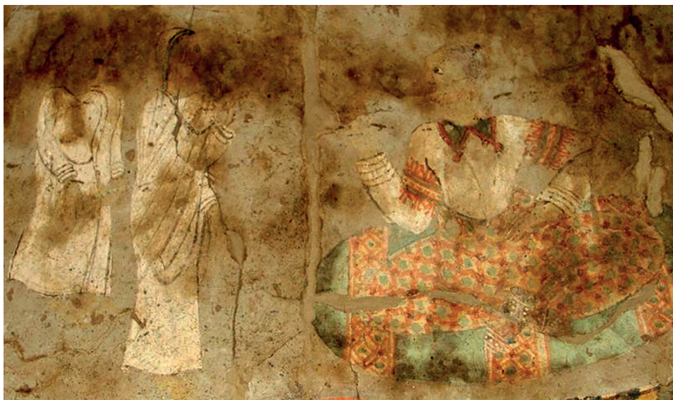
Fig. 11. Tobias and Sara greeted by Raguel – fragment of the painting from Southwestern Annex from Old Dongola Monastery