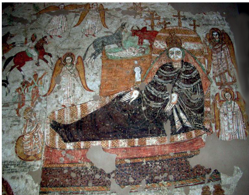
Fig. 3. Nativity from Faras Cathedral – Sudan National Museum in Khartoum