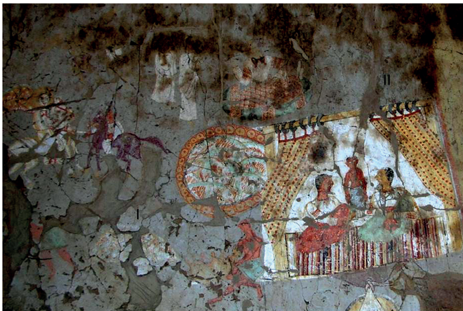
Fig. 9. Story of Tobias – painting from Southwestern Annex from Old Dongola Monastery