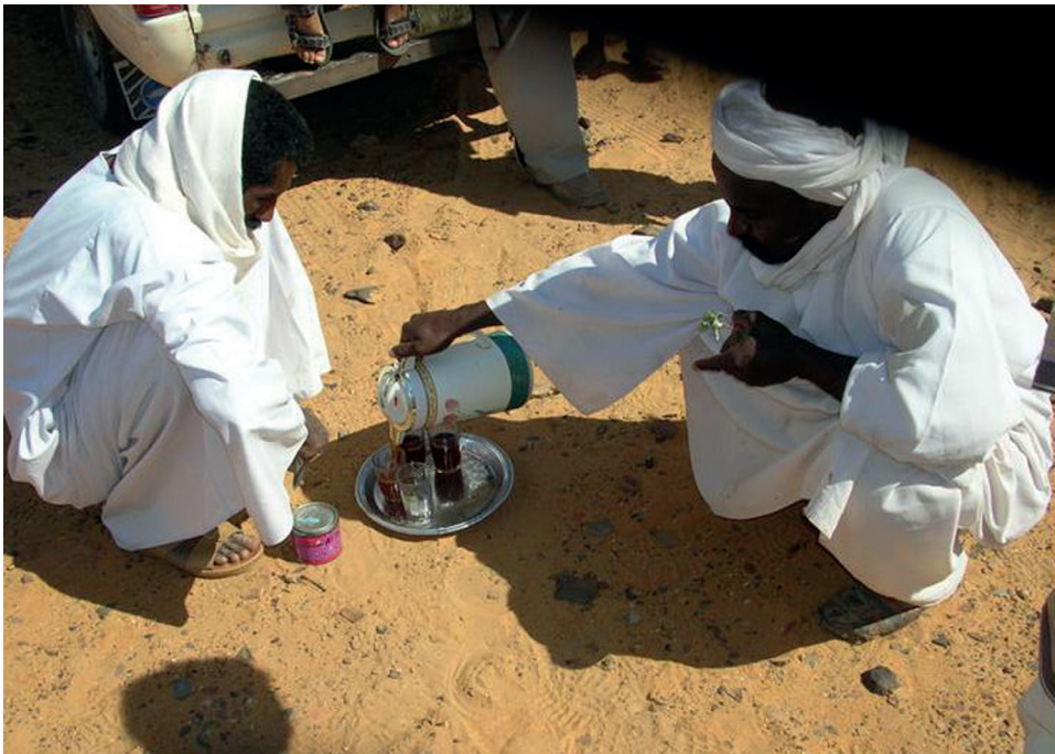
Fig. 16–19. Pictures of the Arabic culture of the contemporary Sudan