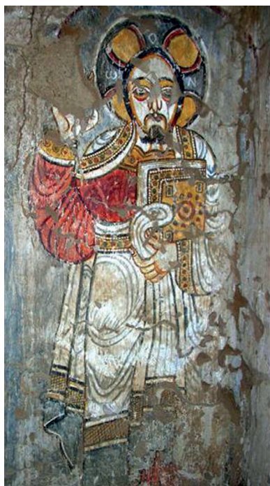
Fig. 6. Christ from Northwestern Annex from Old Dongola Monastery