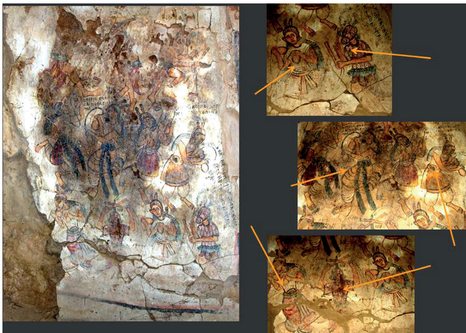
Fig. 12. Dance composition from Southwestern Annex from Old Dongola Monastery