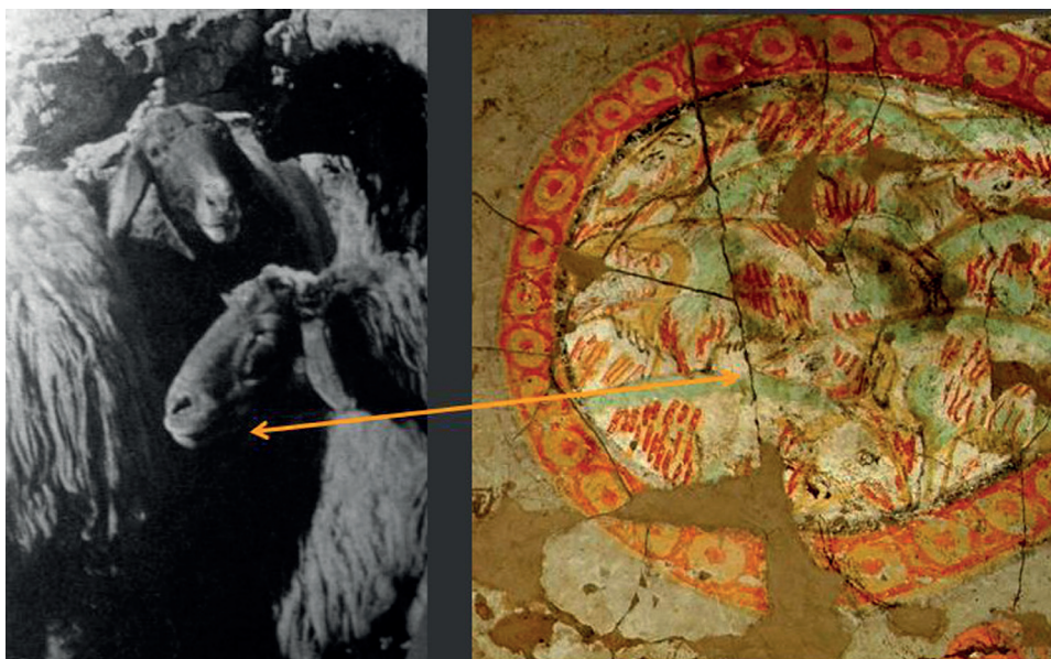
Fig. 10. Sheep corralled in a circular zeriba – fragment of the painting from Southwestern Annex from Old Dongola Monastery