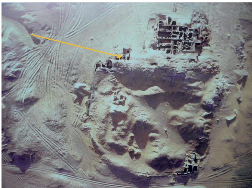
Fig. 8. Monastery compound on kom H in Old Dongola