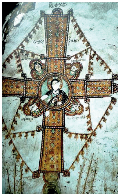
Fig. 5. Votive Cross with Christ at the centre – Sudan National Museum in Khartoum