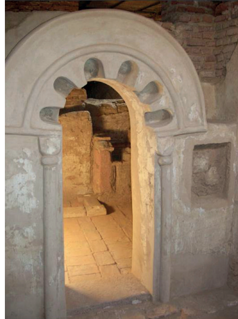
Fig. 14. Doorway giving access to commemorative part with grave recesses in North-Western Complex on kom H in Dongola