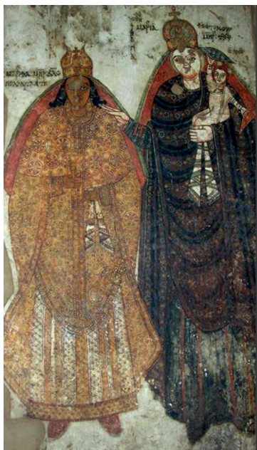
Fig. 4. Martha Mother of the King under protection of St. Mary with the Child – Sudan National Museum in Khartoum