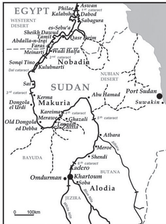
Fig. 1. Sketch Map of the Nubian kingdoms in the Middle Nile Valley

The abode analysis clearly shows that the culture of Christian Nubia, originally based to considerable extent on Byzantine art, in course of time subjected to more and more intense Arabic influence, significantly changed. Arabic components became predominant, which over following centuries led to creation of Arabic culture of the contemporary Sudan (Fig. 16, 17, 18, 19).