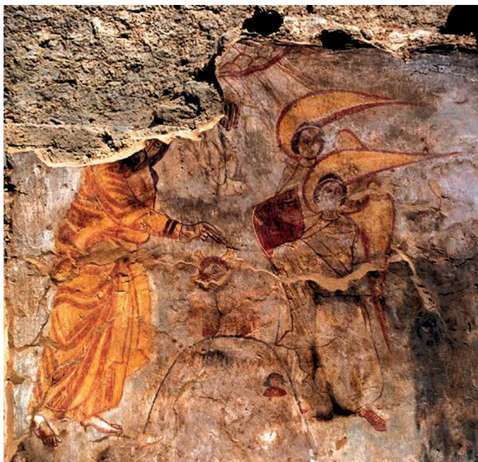
Fig. 7. Baptism of Christ from Northwestern Annex from Old Dongola Monastery