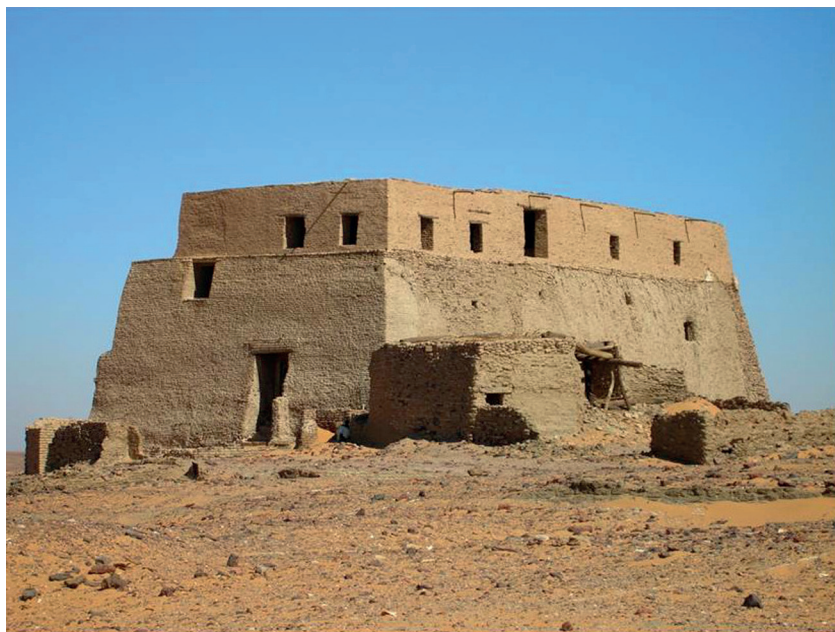
Fig. 2. The royal palace in Dongola converted into a mosque