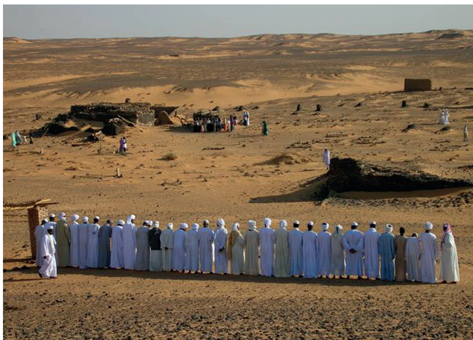
Fig. 16–17. Pictures of the Arabic culture of the contemporary Sudan