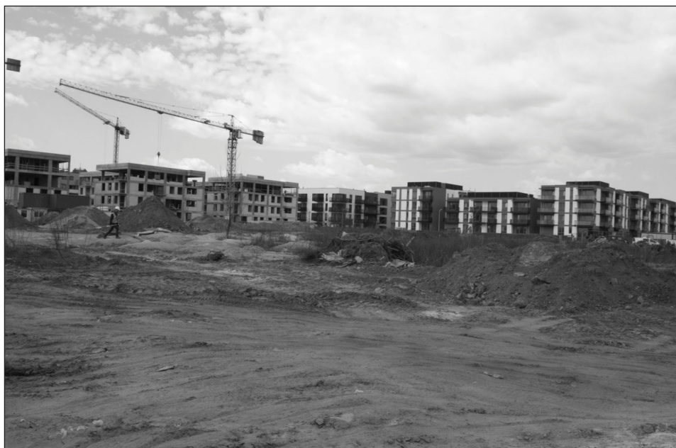
Fig. 3. Intensive urban development in the Wilanowski Cultural Park area