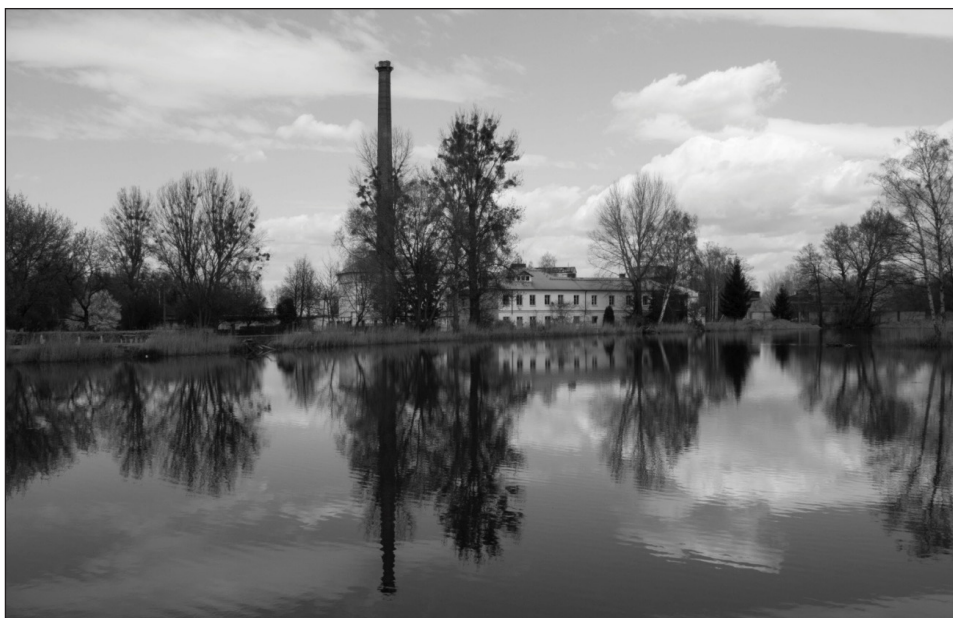
Fig. 5. Paper mill in Mirków