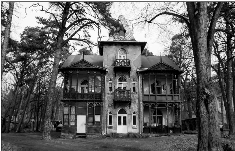
Fig. 4. Old villa in Konstancin