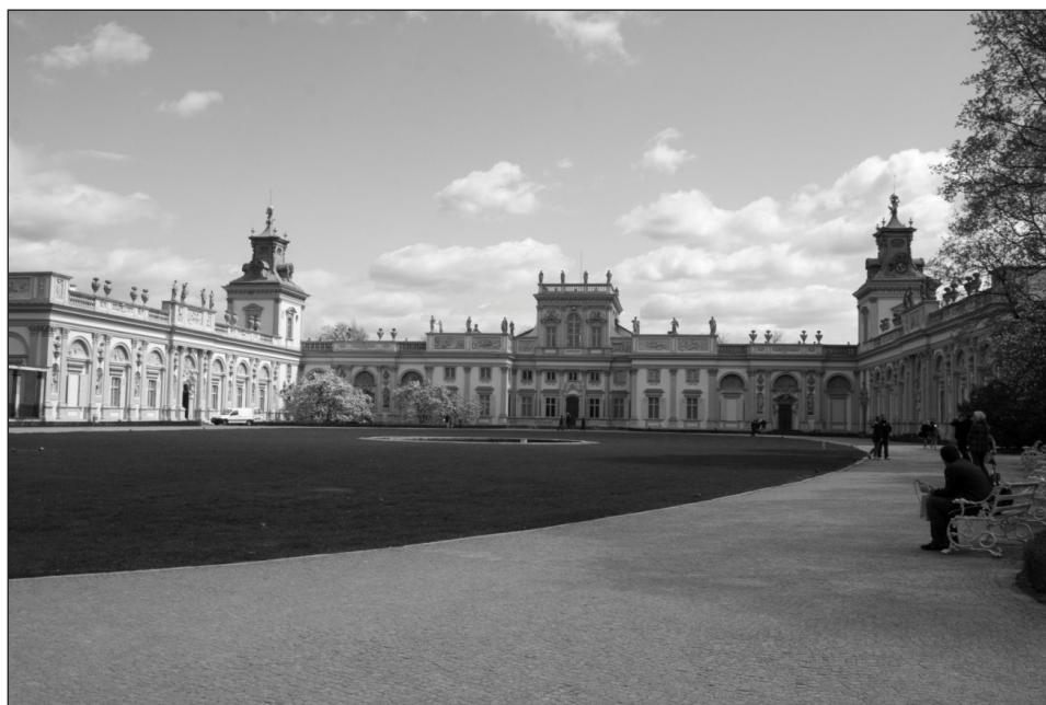
Fig. 2. Baroque manor and garden complex of Jan III Sobieski – the most important element of the Wilanowski Cultural Park area

The most important element of the Wilanowski Cultural Park area is the baroque manor and garden complex, erected at the end of the 17th century for King Jan III Sobieski (Fig. 2). In the times of King Jan III all the most important elements were shaped that have later become the cornerstones of the cultural landscape of Wilanów – the palace, garden, park, farm and the surrounding fields, meadows and forest patches. A visible element of the landscape in the palace's surroundings was a 400 meters long water channel located in the axis of the complex and directed to the West, towards Skarpa Warszawska (Szpanowski, 2006). The contemporary appearance of the complex is the result