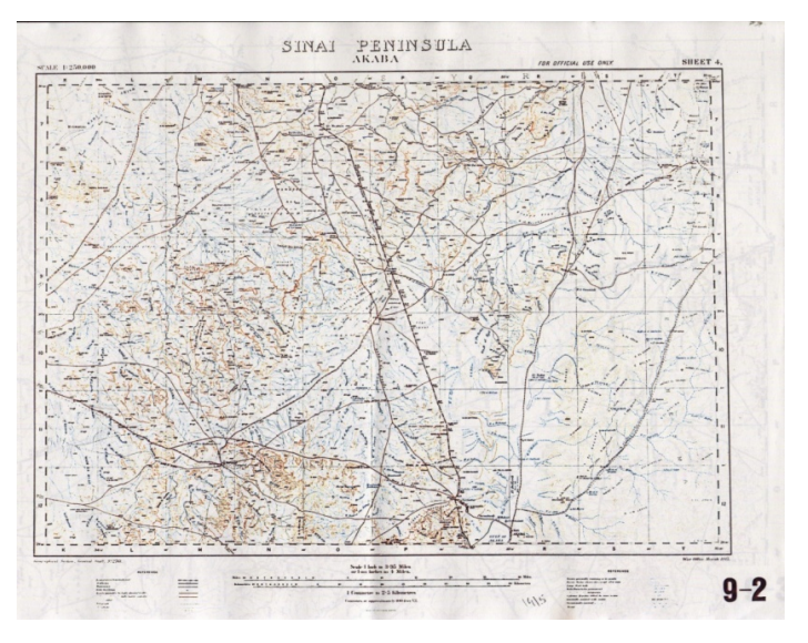
Fig. 4. Egypt (left) - Palestine (right) boundary 1915

Later on the telegraph poles were replaced by stone markers, 1.5 meters high (Brawer 1988, p. 73). Some years later, in 1915, during the First World War, a map was produced by the Egyptian Survey office, showing for the first time the boundary line (Fig. 4).