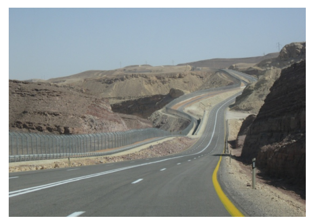
Fig. 9. Israel (right) - Egypt (left) boundary with an Israeli defense Fence