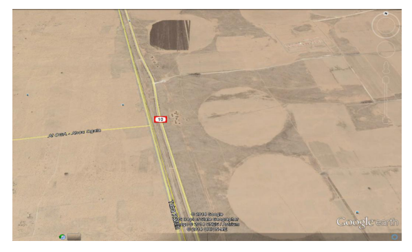
Fig. 8. Different Land use - Israel (right) - Egypt (left) boundary