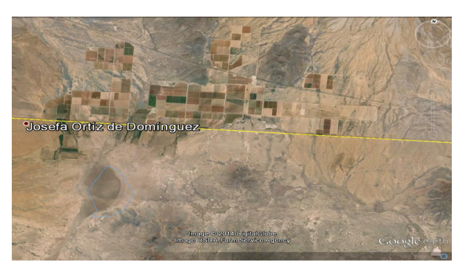
Fig. 1. USA (up) - Mexico (down) boundary