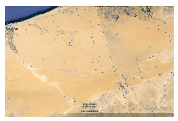
Fig. 5. Israel (right) - Egypt (left) boundary 2013

provisions for full Israeli withdrawal from Sinai, the level of Egyptian force deployments there after withdrawal, and the right of free passage for Israeli ships through the Suez Canal. It also specified that full normal relations were to be established between the states. The Peace Treaty between Israel and Egypt was signed on 26 March 1979. By January 1980, Israel had withdrawn from two-thirds of the Sinai Peninsula, and the final eastern part of Sinai was returned to Egypt in April 1982 (Akehurst 1981).