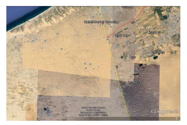
Fig. 6. Egypt (left) - Gaza (up) - Israel (right) boundary 2013

During the first 40 years of the boundary existence (1906–1949), there were not many changes in the landscape on both sides of the border. After 1949, as this line was accepted as the actual border between Israel and Egypt, Israel, for security reasons, close the area near the border to civilians. By this, the Bedouin tribes, which graze their flocks in that area, so that the natural vegetation can continue to exist, even in this very dry area. The Bedouins form the Egyptian side continue their grazing practice, by this cutting all the natural vegetation,