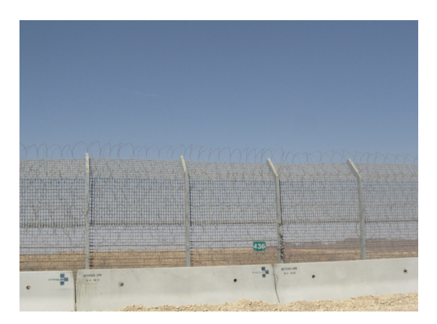
Fig. 10. The Israeli defense Fence - Israel-Egypt boundary

After the Peace Agreement, both countries built boundary roads, parallel to the boundary line, in the distance of about 100 m from each other. Both run in a desert area, and are used only by army vehicles. Israel built a high fence along the boundary, in order to prevent illegal crossing of the line (Fig. 9). It is about 7 m. high, with barbered wire on and in it (Fig. 10). Egypt established some army post along the line in order to prevent such a crossing. Thus, in a totally desert, unpopulated area, two different landscapes were evolved.