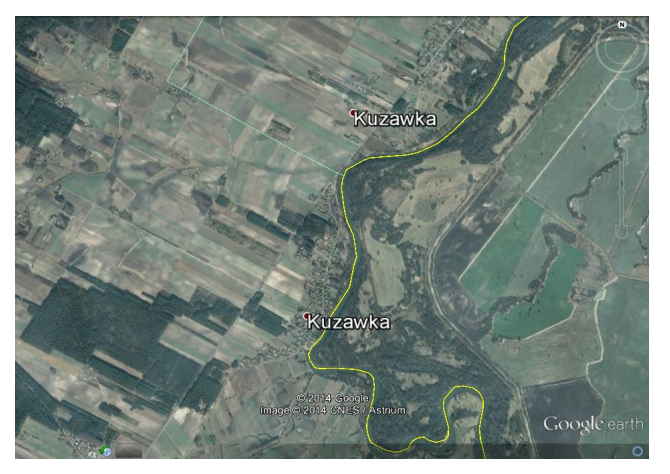
Fig. 3. Poland (left) – Belarus (right) boundary