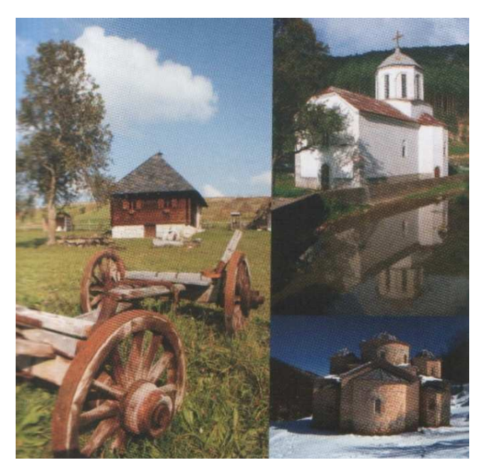
Photo 16. Outside Nova Varoš, South-Western Serbia. Almost deserted village household and two monastery Orthodox Church buildings in a peaceful and quiet Serbian landscape