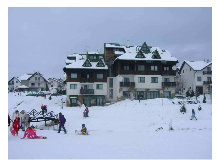
Photo 6. Zlatibor, Western Serbia. Private apartments for rent to tourists, within the ski resort, built on the model of traditional architecture

Serbia is a country with two autonomous provinces and 29 districts. According encyclopedia definition, the village is a settlement with a rural structure, with the agricultural colonization, production and social structure. Previously it was dominated by agriculture. People were focused on the farm and had a small croft with a house and garden with dwellings and buildings for storage and support work on the farm. Now the situation in the countryside and landscape stays middle on the way to the radical change, especially in terms of activities of the rural population. Typical individual agriculture still occurs in its familiar form. However, most individual farmers recently treated cultivation of soil as a seasonal work, working simultaneously in the city or some other non-agricultural sectors.