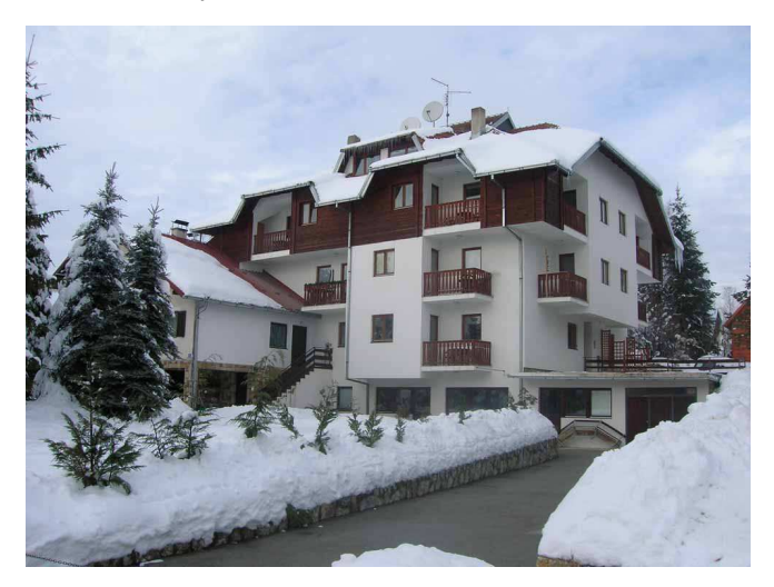
Photo 7. Zlatibor, Western Serbia. Private hotel type apartments for rent to tourists, similar to many buildings in mountainous parts of the country but in the cities as well

The term "Serb village" cannot be defined in an explicit way as a village where most of the population earns for living by plant cultivation and animal husbandry, because the things now are just not quite so. Modern Serbian village, its architecture, constructive materials, spatial layout, function and manner of exploitation are very different in different regions of the country. Natural conditions, time of maturation, the type of conducting agricultural activities (if it still exists somewhere), and social structure – all these factors affect the development of the country.