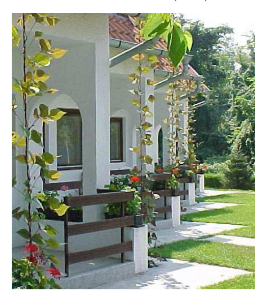
Photo 33. Hotel Serbia – Brka, Srebrno jezero (Silver Lake) outside Veliko Gradište, Eastern Serbia. This privately owned hotel is as yet the only sign of a great revival of tourism in underdeveloped region close to the capital