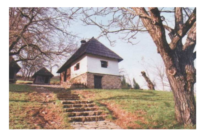
Photo 25. Vuk Stefanović Karadžić's house in the village of Tršić outside Loznica, Western Serbia. One of the first examples of valid renewal of urban and rural architectural heritage in Serbia and Yugoslavia in the past century