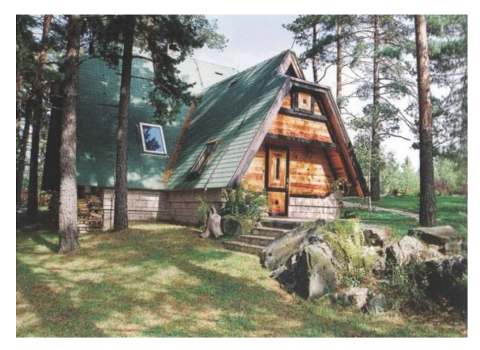
Photo 29. Tara Mountain, Western Serbia. Exclusive apartments "Zeleni čardaci" ("Green Old Houses"), located in the middle of coniferous forests, built exclusively of wood and completely in harmony with the natural environment, and with full comfort for its guests

Generally, the state of Serbian villages and landscapes cannot be considered good enough. The Serbian village is, despite everything that hit it and that it continues to handle, yet dynamic and modern, although its full infrastructure is in many cases still missing.