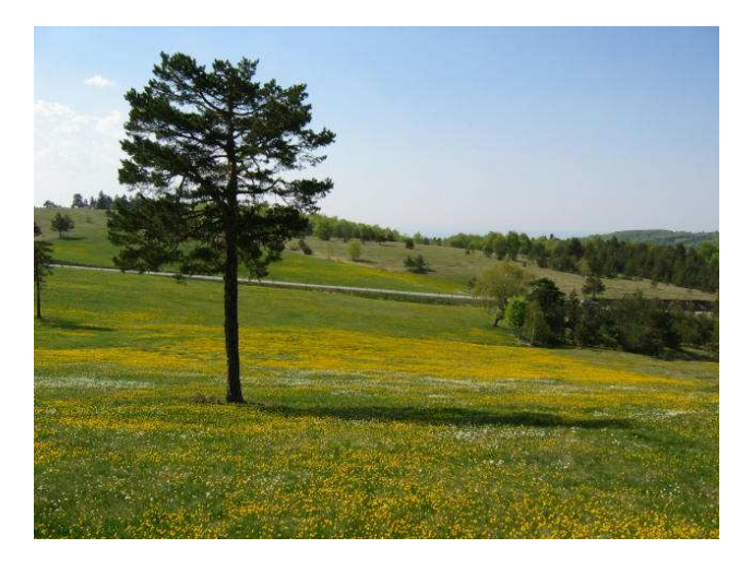
Photo 1. Divčibare, Western Serbia. Serbian beautiful scenery and ski resorts in fast development

In the course of many years of destruction of Yugoslavia and now when Serbia is probably happily independent, the differences between its northern and southern, western and eastern areas remain noticeable. They, of course, neither can nor should disappear.