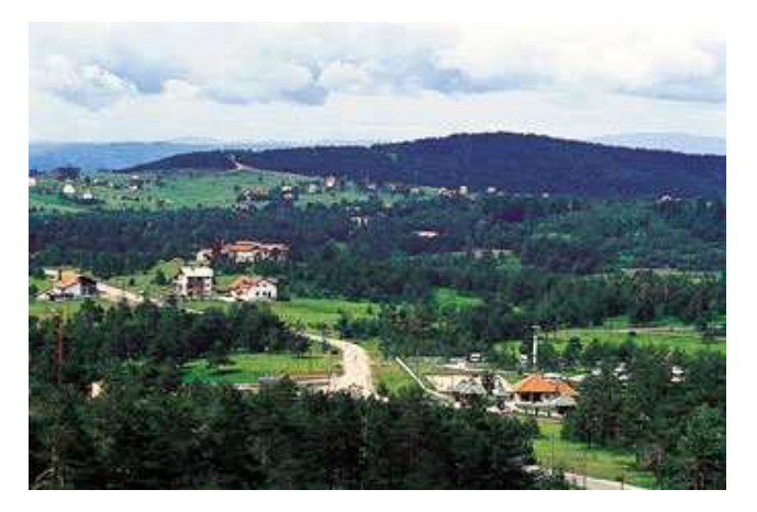
Photo 2. Maljen Mountain, Western Serbia. Attractive environment with modern residential and host buildings set along the roads, like in the city

But this does not apply to differences in the degree of preservation and promotion of the village and the landscape as such, whatever the types of both concerned.