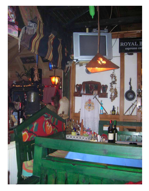
Photo 9. Zlatibor, Western Serbia. The interior of a private restaurant that serves traditional food, equipped according to the latest requirements of catering

The oldest – and most common – form of dense colonization is that of the type of squares and streets, the so-called "plain". "Rounded" form – a multi-square village with individual farm plots, arranged in the form of range – usually around the square – closes nicely tailored, closed ring. This is a very old type of Slavic defense of the village, where the central square was the place where they kept cattle during the night (just in this way, once the old West Slavs established the first village from which eventually emerged today a major German city, Berlin with a central square in place of today's square before the entrance to the Old Museum by architect Schinkel). Type of villages "with more Road", set in a sort of "a skeleton" made of a number of roads with irregular directions, is quite common. Such villages were created mainly in the areas without or with little woods, and their main functions were commercial.