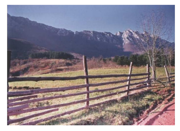
Photo 28. The landscape in Stara Planina (Old Mountain), Eastern Serbia. Like many other from America's Rocky Mountains to the Russian Baycal Range, but uniquely ours. Future ski resort of the highest rank