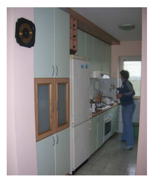
Photo 32. Surčin outside Belgrade, Central Serbia. Inside a home, no less comfortable than the most advanced in any city