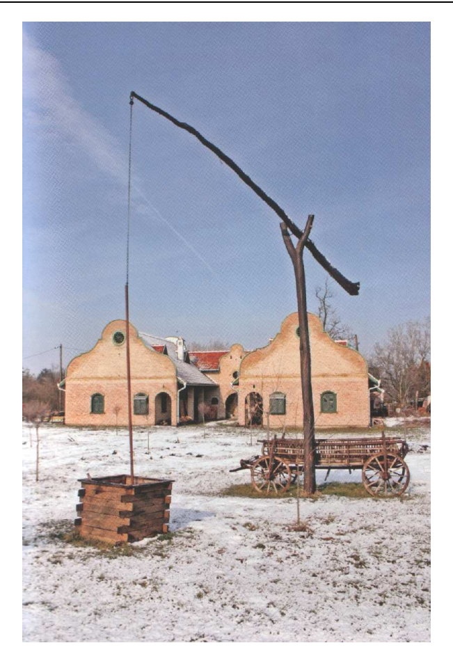
Photo 21. Tiganjica Restaurant at Carska Bara Village, near Zrenjanin, Banat, Northern Serbia–Vojvodina. Almost abandoned rural home that turned out to be the picture of one of the most famous Serbian painters of the realist, that simply cries out to its return to full life, even if slightlydifferent than it originally was

Source: This Way Serbia – Tourism and Cultural History Guide through Serbia, Belgrade (2006)