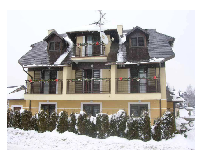
Photo 5. Zlatibor, Western Serbia. Private apartments for rent to tourists, in a villa similar to many that are recently built in the cities

Selecting sites for colonization depended on the natural environment. Forms and structural elements of residential dwellings and buildings on the farm were required in connection with the old customs, traditions and local capabilities. This is related to churches and other religious buildings as well, built from local materials always.