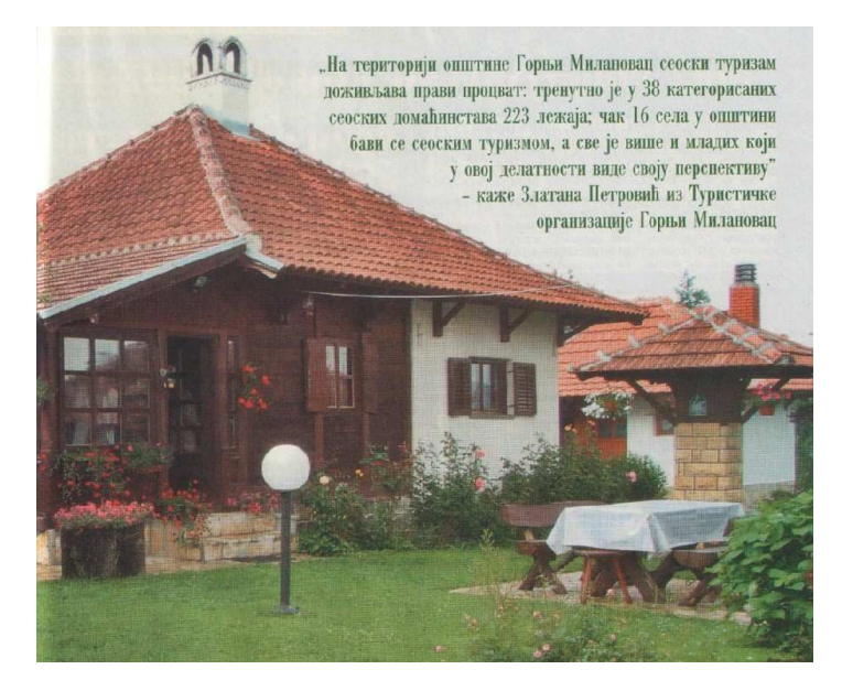
Photo 11. Grabovica village near Gornji Milanovac, Central Serbia. Rural home "Villa Melody", owned by Živanka and Ivan Ivanović. Rural Tourism in Serbia is well on the road, and it should be much better supported