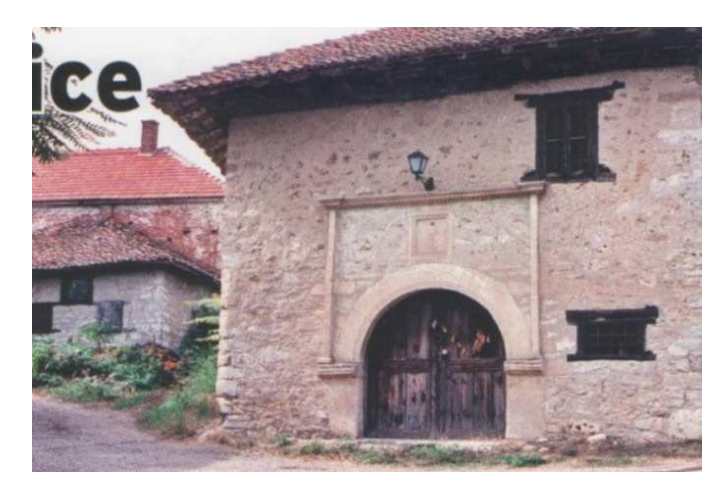
Photo 20. Rajačke Pimnice near Negotin, Eastern Serbia. 300 of these buildings located outside the village and near vineyards are erected only to be lived in while at works in the vineyards. Example of what does not exist anywhere else in the Balkans, but not sufficiently well known and visited