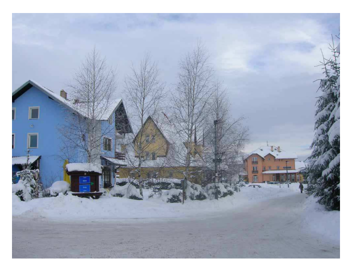
Photo 4. Zlatibor, Western Serbia. New rural homes for rent to tourists within their almost urban environment up on the mountain plateau