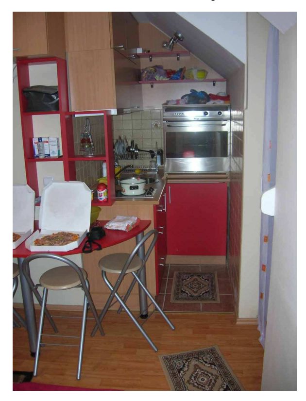
Photo 8. Zlatibor, Western Serbia. The interior of a private rental apartment intended for tourists, equipped according to the latest requirements of a comfortable residence

Strangely enough, the number of people who decide to make their second home a village house, still increases. The rural structure becomes so similar to its urban counterpart. Urban civilization (the complete technical infrastructure, computers, Internet) is reached in the rural landscape.