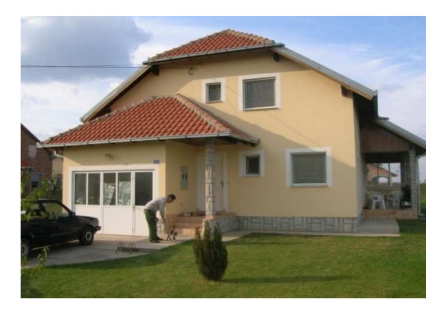
Photo 30. Surčin outside Belgrade, Central Serbia. One of the new houses, no different from some in a "more urban" part of the metropolis, for example in Voždovac