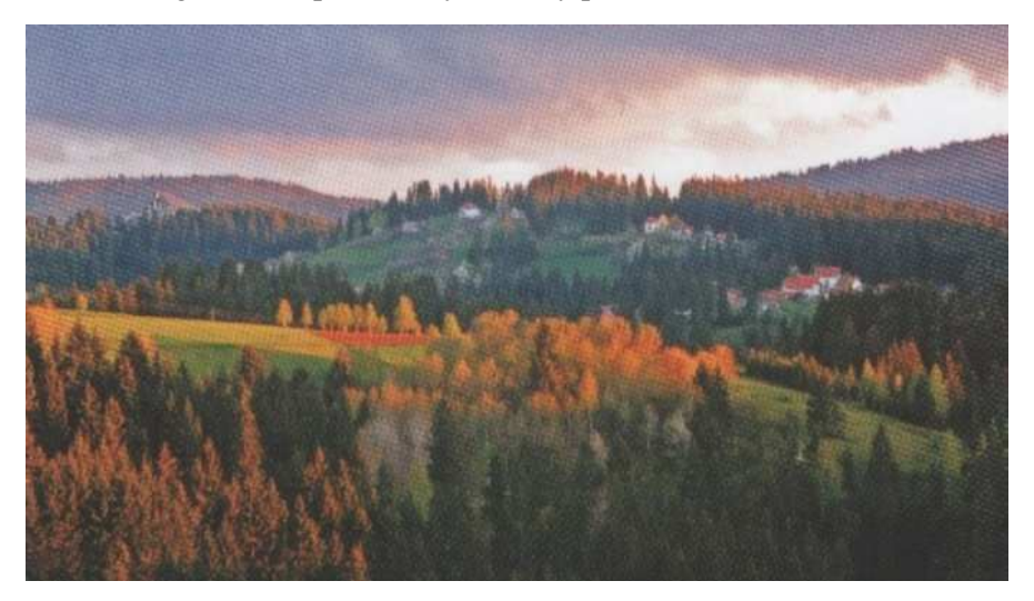
Photo 14. The landscape with dispersed village near Nova Varoš, South-Western Serbia. The beauty that stops one's breathing