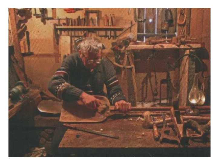
Photo 15. Outside Nova Varoš, South-Western Serbia. An old craftsman who does not give up easily, considering his duty to help the old crafts survive