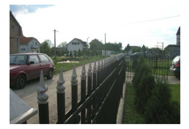
Photo 31. Surčin outside Belgrade, Central Serbia. Street in the village-town which becomes fast part of the metropolis, but now in quite a new way: almost without losing their own, rural benefits

Serbian landscape is still largely "urban". The main reasons for the increasing popularity of rural areas are quiet environment, tranquility, contact with nature, less vulnerability to violence and easy access to everything the city has to offer.