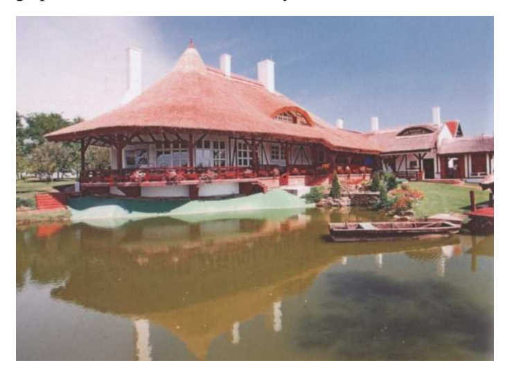
Photo 23. Salaš (Farm) 84 outside Novi Sad in Bačka, Northern Serbia–Vojvodina. A perfect place for a holiday not only for business people, very close to the European Highway Corridor No 10. Vojvodina-type old farm converted into a very small hotel of very high luxury class, all the best of a domestic atmosphere so characteristic for this part of the country

In the near future, especially in agricultural villages, the main emphasis should be placed on the development of environmental and bio-dynamic farming. Modern Serbian agriculture still cannot be described as highly effective, even it generally manages to provide self-sufficiency in production for the whole nation, and export of its products is quite substantial. Arable land covers a huge part of total area of the country.