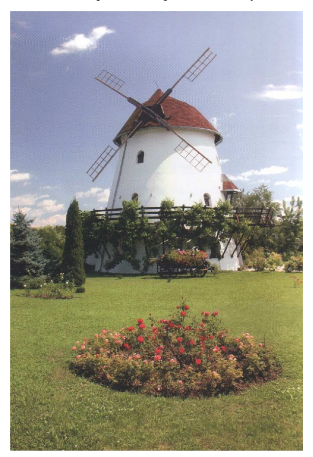
Photo 22. Old windmill near Sombor in North-West of Bačka, Northern Serbia–Vojvodina. Another in a series of beautiful placesin our beautiful country, for all those who value life, loves themselves but the world around them as well

People with high incomes and long work experience are particularly interested in life in the village, as elsewhere in Europe and the developed parts of the world. They usually emphasize the benefits of immediate environment, environmental quality, beauty; the landscape is very close to nature, tranquility, peace and different vacation options, compared to the city.