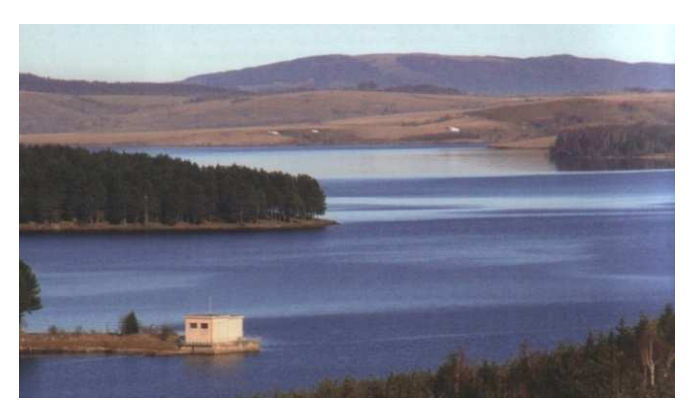
Photo 27. Landscape with Vlasina Lake, South-Eastern Serbia. Ice cold mountain waters reserved by human hand among the mountains, in a royal blue lake on which shores until now tourism has not caught a stronger root

Rural landscape often characterize particular social relations (i.e. neighborhood), strict structure and norms (customs, folklore, holidays, etc.), as well as architecture, clothing, food and more. With the onset of industrialization, groups of people non-active in agriculture accepted the work in rural areas as a way to earn money.