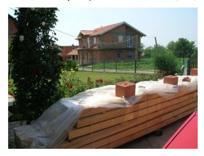
Photo 17. Ostružnica village outside Belgrade, Central Serbia. Near the metropolis, the river Sava and two intersecting European highways, with houses and properties that belong to the village, but to the city as well