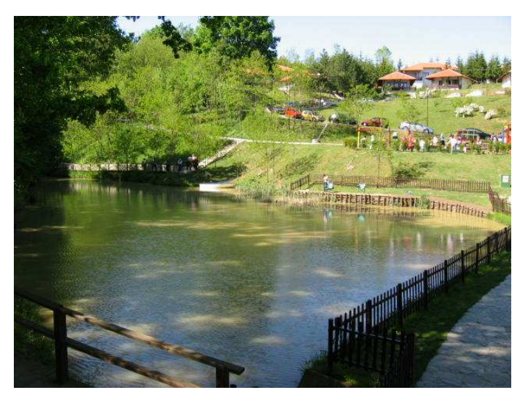
Photo 10. Kosmaj Mountain, village and hotel Babe, Central Serbia. Just outside Belgrade, a two million metropolis, for one to rest the heart and soul, that still deserves more contribution, upgrading and regulation

This is also one of the oldest types throughout Europe, which occurs in the entire belt of fertile soil from France, through Germany and Italy, all the way to Poland, Ukraine and Russia, and Serbia and Bulgaria. The type of a "one way" village, with condense construction on the sides of the road, highly associated with physiographic factors, is also worth mentioning. Linear settlements usually are placed along the river or river valley. In such cases the court is organized in a straight line, one beside the other. Access roads begin at the entrance of the plot and lead the host to the buildings and fields. Density of built area in the Serbian landscape is different in different regions. Very large density is typical for the villages in the areas south of the Sava and Danube, and between the Drina and Morava, unlike areas north of the Sava and Danube in Vojvodina, where the density of the development of the landscape is relatively low. Host courtyards and buildings are also different. It is possible to distinguish various forms of built rural areas, the size of villages and their character, position of buildings to each other, the division of functions among the buildings, number of floors and the number of individual buildings within a host yard, constructive elements, etc.