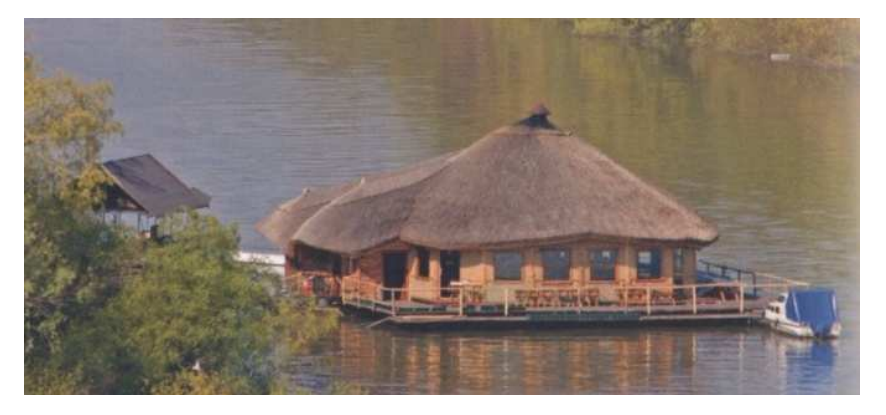
Photo 19. Raft nearby the confluence of the Sava and Danube, in the midst of Belgrade, Central Serbia. Catering bait, an ex ample which could serve the many who have Serbian landscape in their heart and soul, especially if they are close to two great rivers

The aim of such projects is a limitation of undesirable intervention in the local landscape and its protection. A kind of village-museums has long been available in Serbia too – for example Museum Staro Selo (Old Village) in Sirogojno designed by architect Ranko Findrik – that has become a tourist attraction.