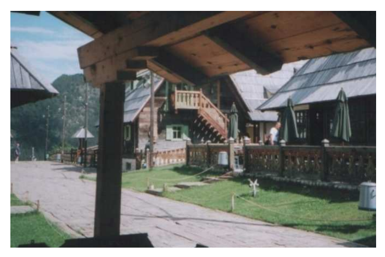
Photo 13. Mokra Gora, village-town Mećavnik, Western Serbia. Conception and realization of a great Serbian film director Emir Nemanja Kusturica, which is still happily developing