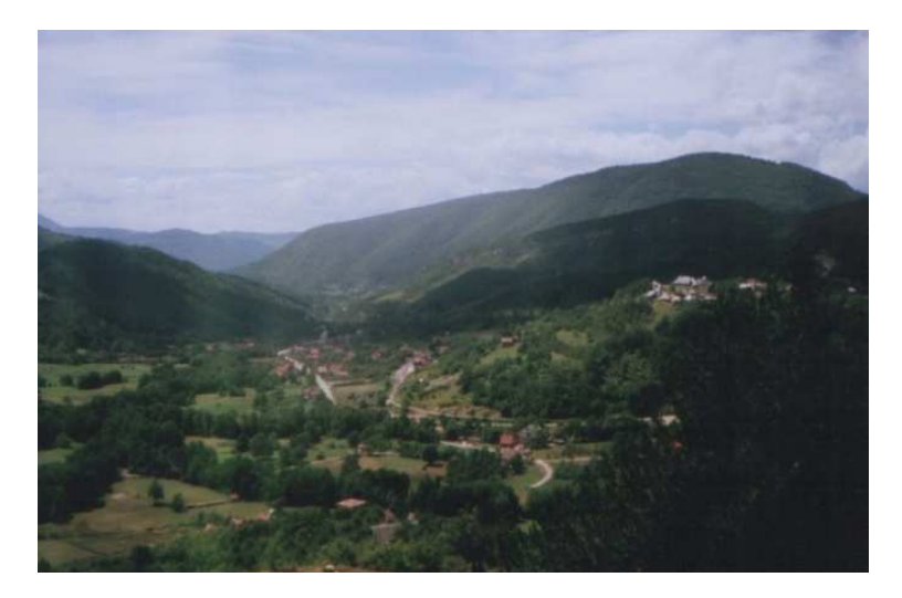
Photo 12. Mokra Gora (West Mountain) village at the foot and the village-town Mećavnik (Snowstorm) up the hill to the right, with the Orthodox Church in the axis of the main street and other buildings thereto, Western Serbia. An excellent example of how one person's inspiration embodies the general benefit of all in the Serbian countryside