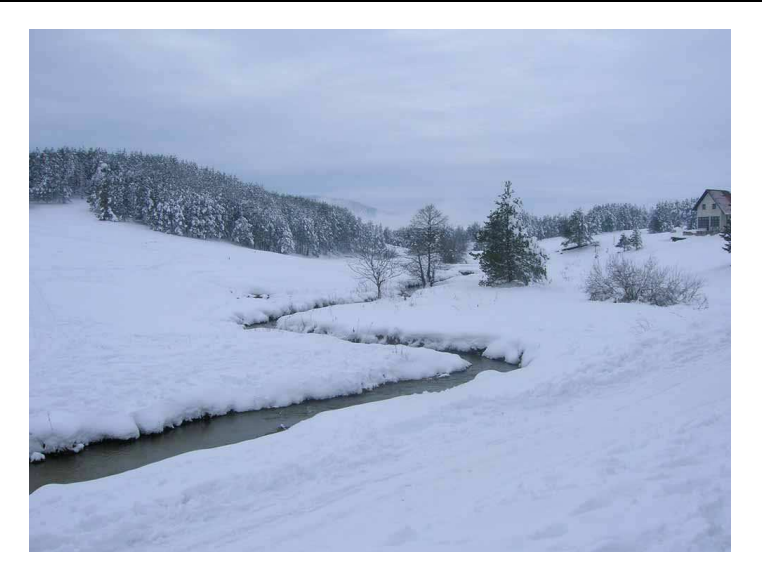
Photo 3. The landscape in Zlatibor, Western Serbia. The beauty of total natural harmony

Photos of all: the developed, less developed and still underdeveloped parts of the country are proof that the process of transformation of Serbian villages and landscapes in this or that degree and measure started almost everywhere. But it was actually never interrupted. Traveling around Serbia, wherever within its borders, even not very attentive observer may notice a huge stress in any part of its space. That is of course connected with the constant and of rapid modernization and reconstruction of the country, which does not always lead to results which we all can be proud, not only in terms of expressiveness of Serbian and other cultural heritage available. Evidence of urbanization of Serbian villages and the landscape are visible to the naked eye. Built were and still are being built: shopping malls and service centers, public buildings, small, medium and large houses, sometimes whole housing complexes, similar and sometimes identical to those urban.