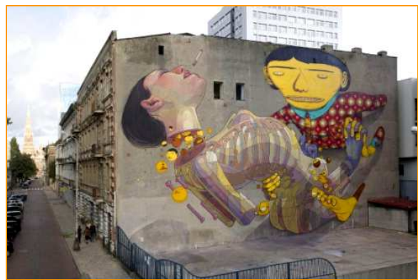
Photo 5. Mural at 5 Roosevelta St, Łódź