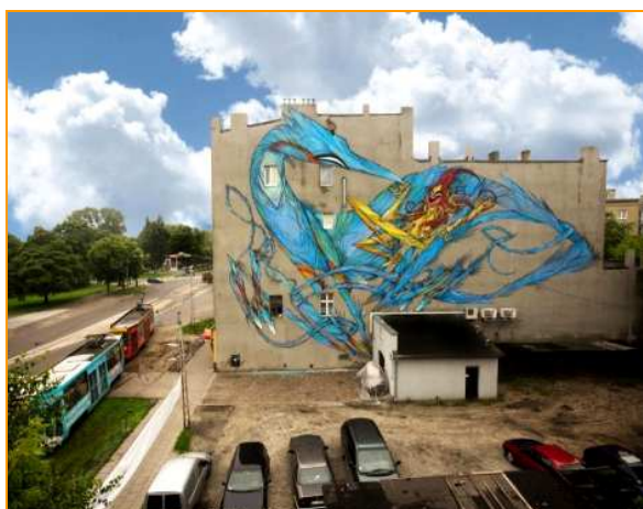
Photo 8. Mural at 82 Wojska Polskiego St, Łódź