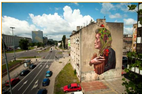
Photo 10. Mural at 16 Politechniki St, Łódź