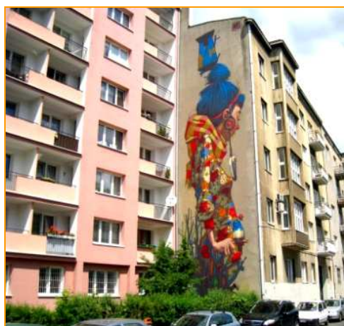
Photo 9. Mural at 12 Uniwersytecka St, Łódź