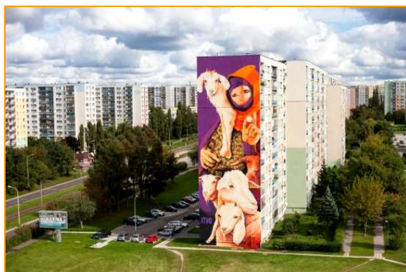
Photo 11. Mural at 80 Wyszyńskiego St, Łódź

An interesting example of the creation of a new, attractive place in Łódź by an accumulation of murals is 3 & 12 Uniwersytecka St (Photo 9) and the mural in 59 Jaracza St situated close by. According to the opinion of local residents they are identified with each other and often mentioned together.