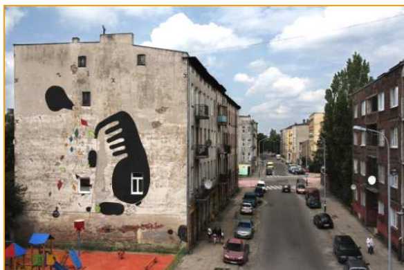
Photo 6. Mural at 25 Pogonowskiego St, Łódź