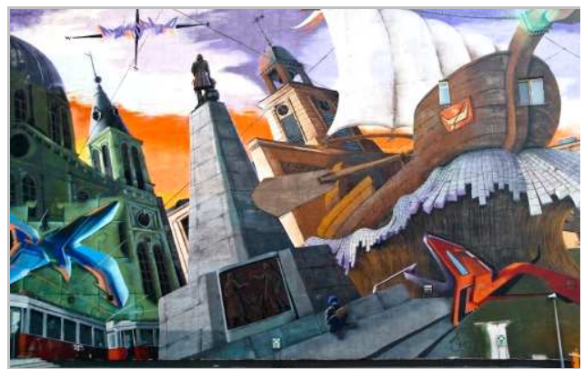
Photo 3. Mural at 152 Piotrkowska St, Łódź

The opening of the Museum of Art in the 'Manufaktura' shopping mall in 2008 marked a new beginning for murals in Łódź and the first city tour of the murals in Łódź was organized. Interest in street art was gradually increasing. Amateur artists began to be recognized and gained an increasing audience. The allegory of the city on 152 Piotrkowska St created by Design Futura Group in 2001 was the first large scale street art project in Łódź although significantly differing from the other murals created at that time (Photo 3).