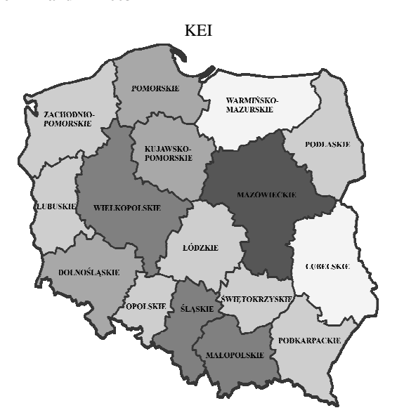
Figure 2. Maps of the KEI and KI 2003 \,