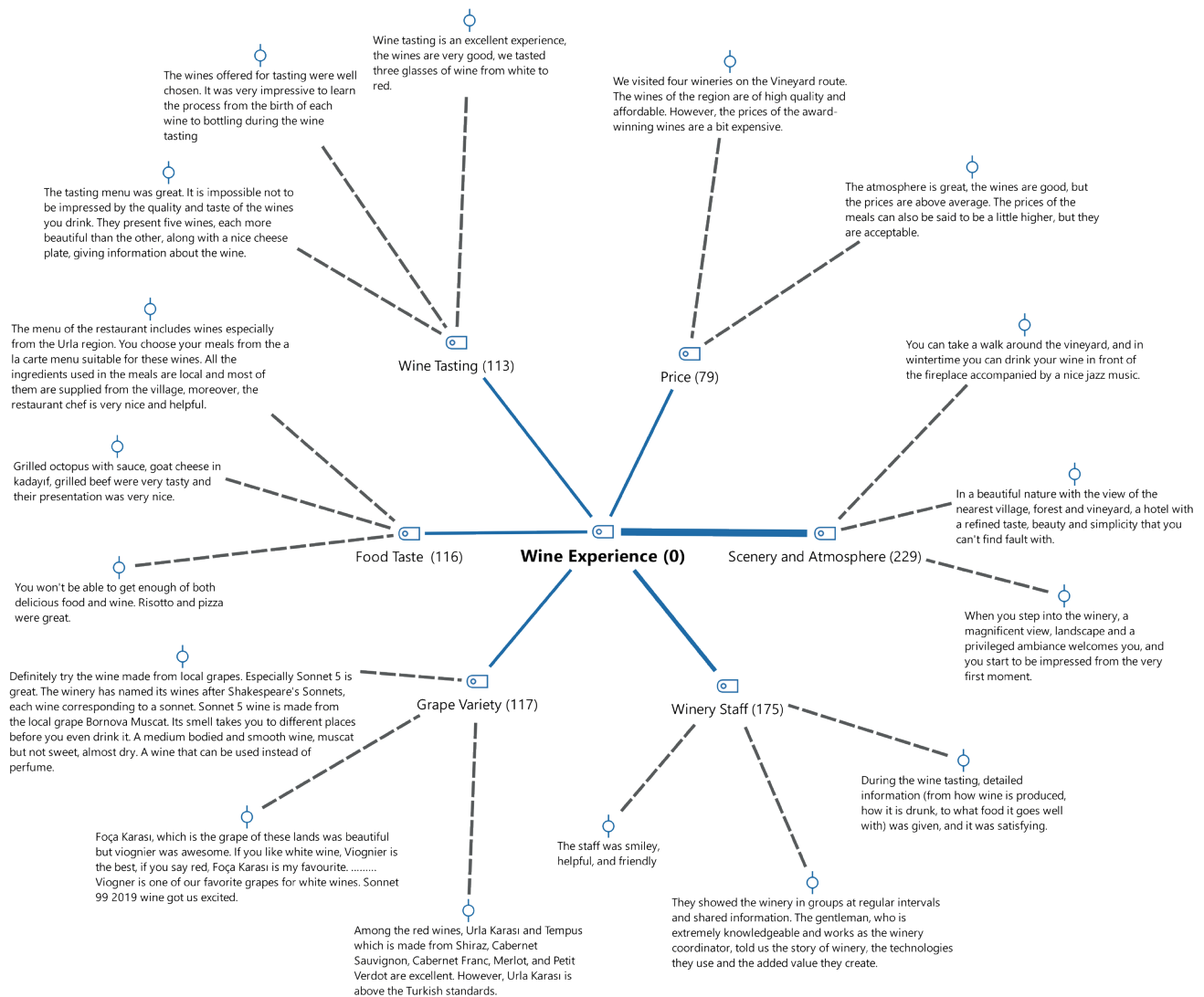
Figure 3. Main themes affecting wine experience