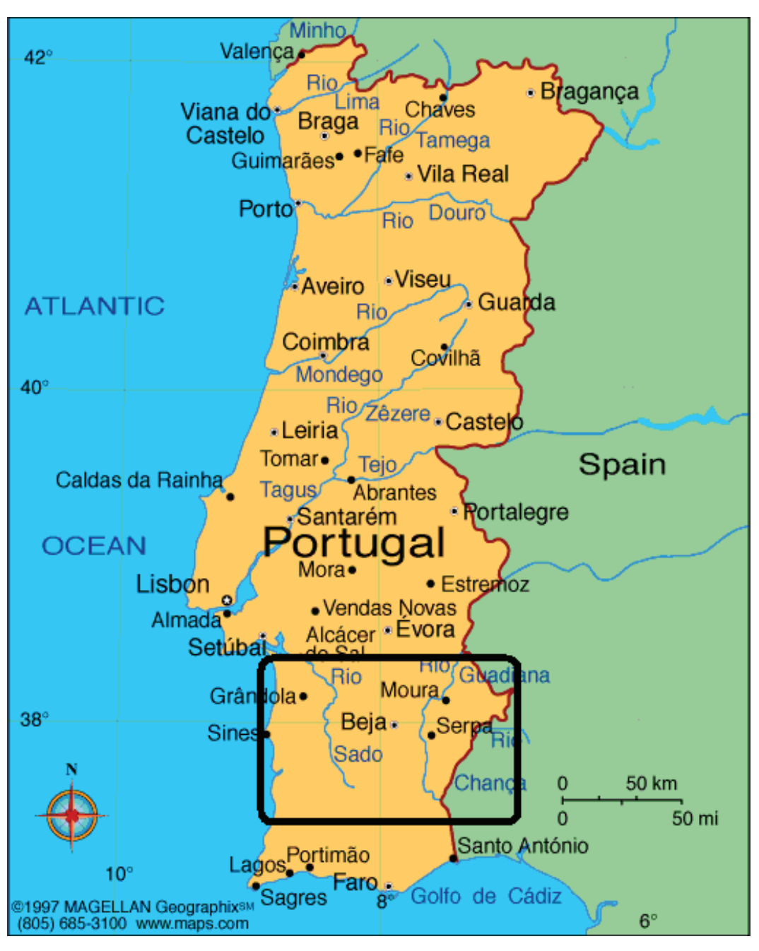
Figure 2. The territory under the direct influence of the IPBeja

The Polytechnic Institute of Beja (IPBeja) is located in Beja, the capital of Baixo Alentejo region and has as direct influence in the geographical areas called Baixo Alentejo and Alentejo Litoral. The IPBeja is the only public HEI in the region.