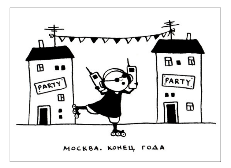
Moscow. End of the year. A Muscovite is always in a rush trying to fill every minute and set a record in making connections.