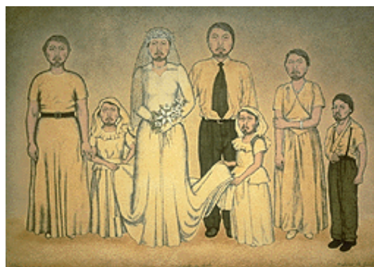
Fig. 1 Zenil, Nahum. Retrato de boda (Wedding portrait).

From this perspective, the work of contemporary artist and gay activist, Nahum B. Zenil is favorable. In his work could be seen different scenarios that inevitably lead us to question national and sexual identity, social hierarchy, ethnicity, family and religion (Fig. 1). Of great interest are the