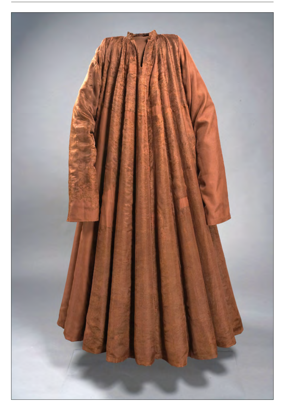
Fig. 8. Dress from the tomb of John of Görlitz (according to Lutovský, Bravermanová 2007).