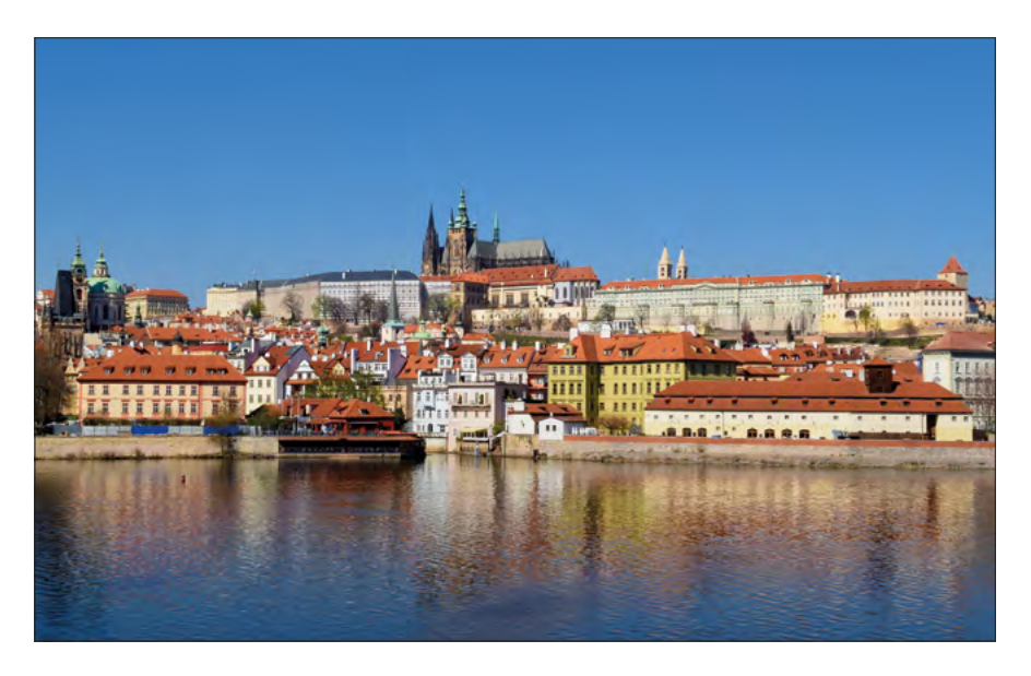
Fig. 1. Prague Castle.

Renaissance rulers were buried in the mausoleum (Ferdinand I †1564; Anne of Bohemia and Hungary †1547; Maximilian II †1576).