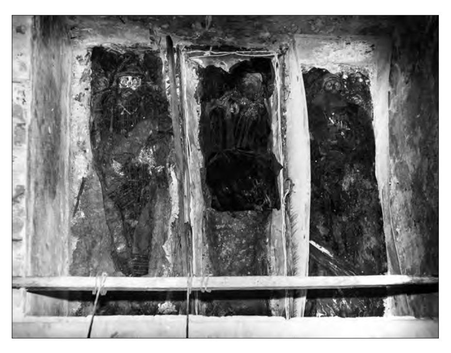
Fig. 5. Remains of Ferdinand I, Maximilian II and Anne of Bohemia and Hungary in the Renaissance mausoleum (according to Vlček 1997: 82).

The first systematic anthropological investigations were conducted at the beginning of the 20^{th} century. The foundation of the research was morphology, i.e. a description of the individual parts of bones, the identification of possible anomalies and