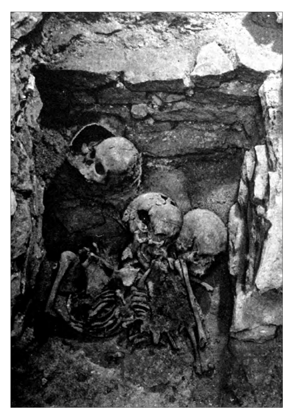
Fig. 2. Remains of Spytihněv 1 and his wife in the Church of the Virgin Mary (according to Vlček 1997: 87).