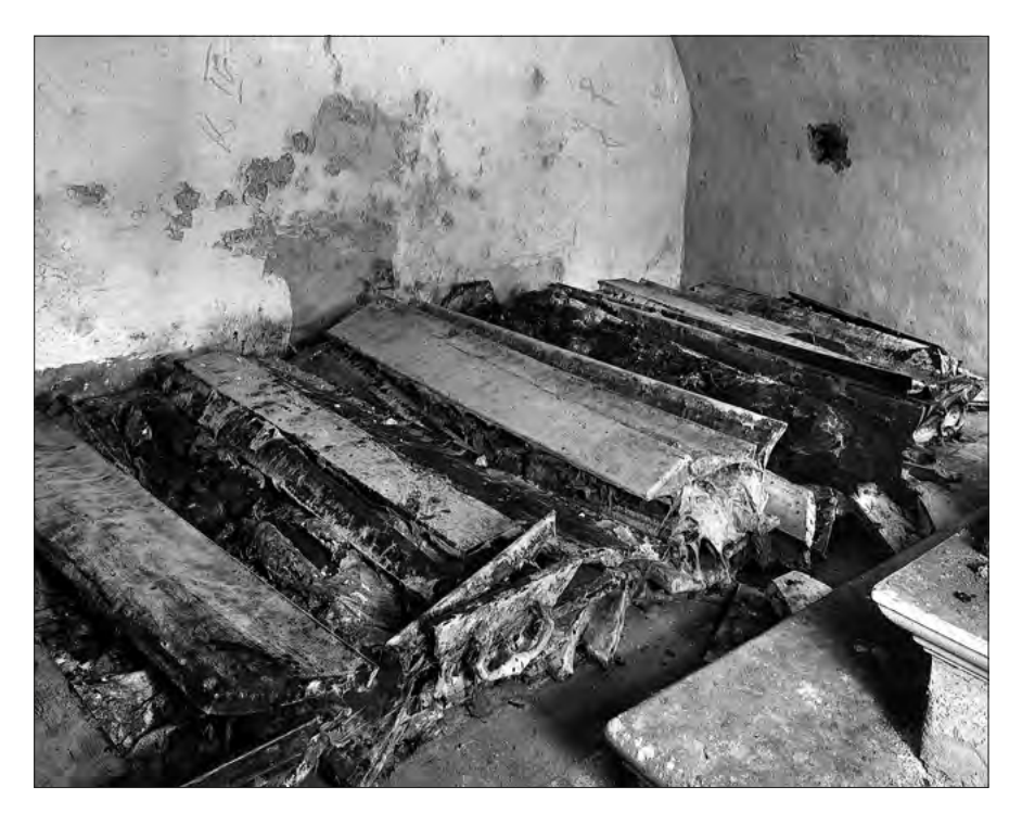
Fig. 4. The Royal Tomb in 1928 (according to Hilbert et al. 1928–1930: 245).

The manner in which the graves were opened in the 20<sup>th</sup> century can already be regarded as building-historical and archaeological investigations. However, they were not always conducted in a proper manner, despite the fact that archive sources related to these activities mention the names of professionals. The tombstone of St. Wenceslaus was studied with relative care in 1911 (Podlaha 1911) and