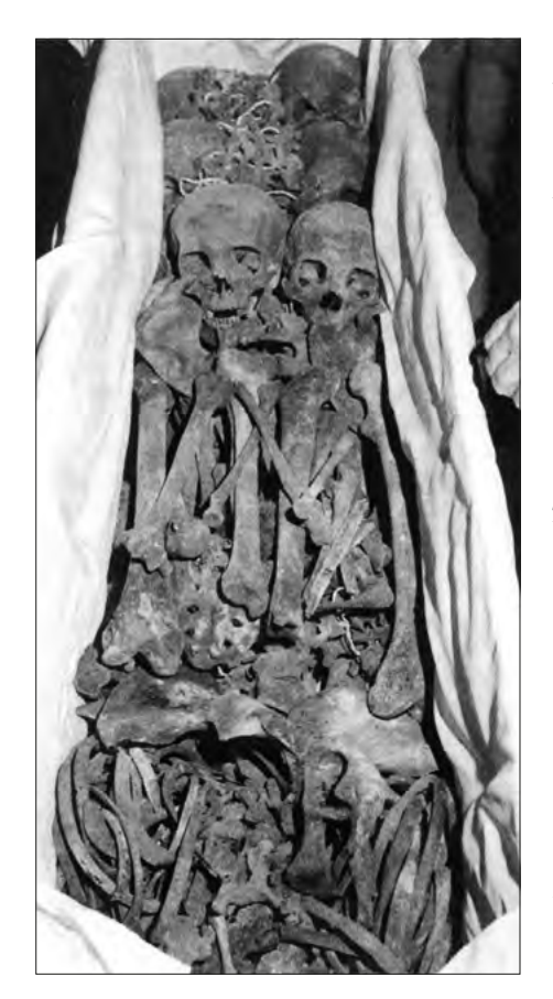
Fig. 6. Mixed up remains from the coffin of Czech queens (according to Vlček 1999: 210).

an evaluation. One interesting method was an attempt to determine which skull and skeleton in the common coffin in the royal tomb belonged to which queen (Matiegka 1932). In addition to comparing the age of skulls and skeletons with their age at death, the method of superimposing the skulls on the busts on the triforium in St. Vitus Cathedral, of which it is said that they have very realistic traits, was also employed at the time (Matiegka 1932: 5, 13; Vlček 1999: 213). The remains of nearly all historical personalities buried at Prague Castle were available for another anthropological study conducted in the 1960s. Although more modern methods were utilised, the basis of the work was again morphology. Gustafson's method for determining age based on the condition of teeth was used for the first time (Vlček 1997). And yet, the interpretations often did not agree with historical information and triggered considerable debate. This method is now rejected by even anthropologists themselves (Sláma 1983; Brůžek, Novotný 1999).