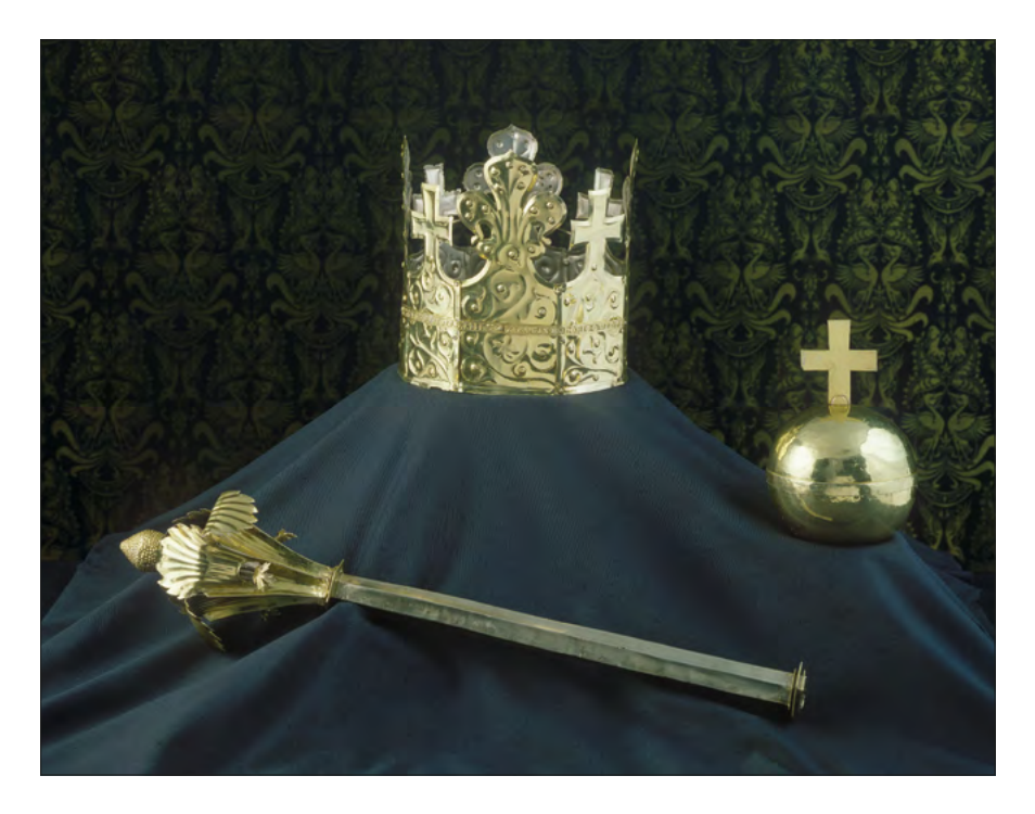
Fig. 7. Funeral jewels from the tomb of Ottokar II (according to Lutovský, Bravermanová 2007).

Chemicals were used to aggressively clean fine fabrics with remnants of gold threads, resulting in the heavy loss of material. A reconstruction of the original form or an interpretation of the entire situation were either not performed or done incorrectly (Bravermanová, Otavská 2000: 410). Finally, a hot iron was used to attach a backing with a polymer to the remarkably fine and precious reliquary textiles of St. Ludmila (Bravermanová, Otavská 2001). The Renaissance clothing was also poorly restored: without accompanying documentation, the robes were cleaned with chemicals typically used for removing rust, individual textile fragments were trimmed with scissors and sewn to a new base with darning yarn (Bravermanová et al. 1994: 439–441).