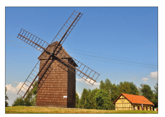
Fig. 4. The post mill in Dębe (Greater Poland Province).

The windmill in Dębe dates back to the first half of the 19<sup>th</sup> century. In 2007, the Commune Office in Lubasz, due to the progressing degradation of the mill, started to apply for funds for its renovation and reconstruction. The preparation took a few years and required considerable effort