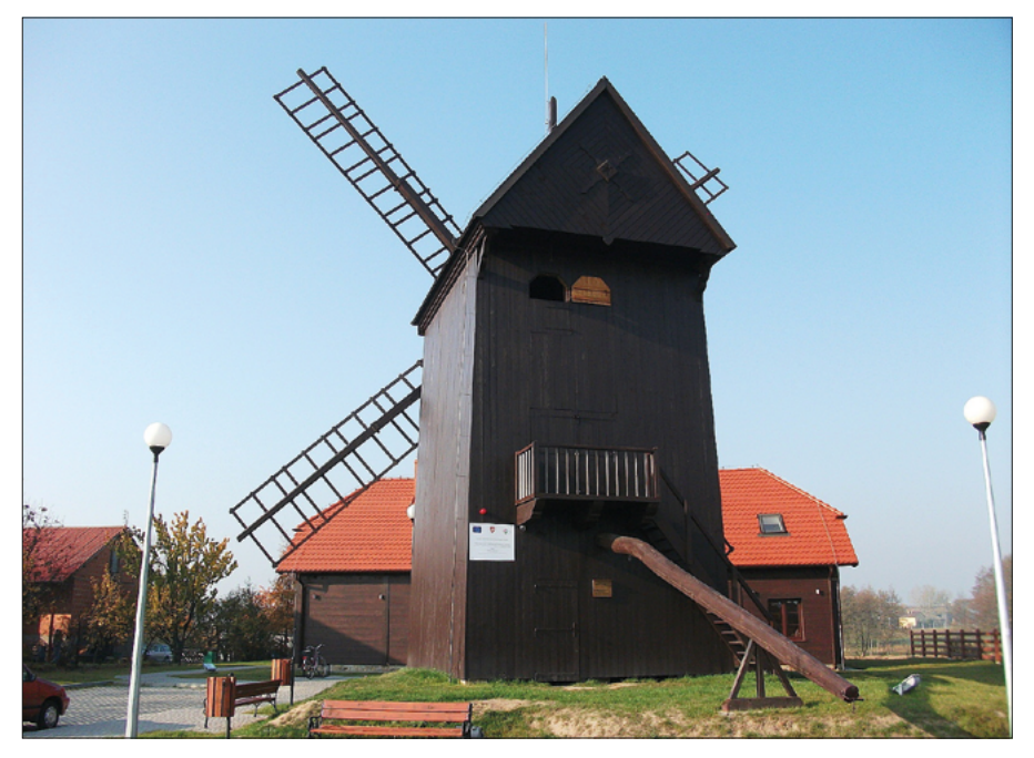
Fig. 2. A post mill in Budzisław Kościelny (Greater Poland Province) (source: http://www.konin.naszemiasto.pl/artykul/wiatraki-kozlak-w-budzislawiu-koscielnym-zdjecia,1948511,art-gal,t,id,tm.html, access 20 VI 2017).

It is worth noting that over the last few years more and more initiatives have been launched with the aim to renovate windmills. Many of the buildings were restored between 2007 and 2013 under the Rural Development Programme as part of the 'Renewal and Development of Rural Areas' activity.