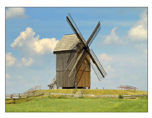
Fig. 3. The post mill in Duchowo (Lower Silesia Province) (source: http://www.dolny-slaskorg. pl/5274275,Historia_wiatraka_w_Duchowie.html, access 20 VI 2017).

The post mill in Duchowo was built in 1671. The renovation work on the building was performed in 2010. It is now a venue for meetings of local inhabitants and a tourist attraction for visitors (www. dolny-slaskorg.pl/5274275,Historia_ wiatraka_w_Duchowie.html).