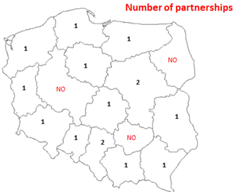
Map 1 The number of partnerships of Polish regions with Chinese counterparts (2016).

Officials from both sides confirm the value of the subnational dimension of Sino-Polish relations. President Xi said at the China-Poland Regional Cooperation and Business Forum that “we should optimize the mechanism to forge a synergy from