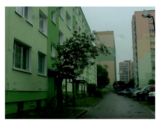
Picture 4. The sole Syringa in the neighbourhood – the landmark facilitating wayfinding on the scale of a block (Visibility)