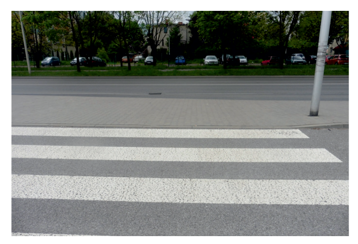
Picture 2. No logical connection to the foothpaths in the neighbourhood