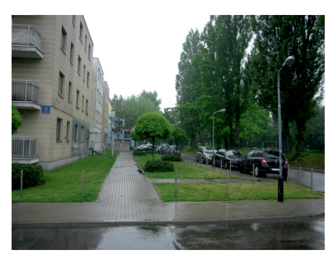
Picture 8. Lined-up blueprint without recessed doorways (Territoriality: not accommodating for throwing away litter!) and balconies for extra "social eyes and ears" (visibility)