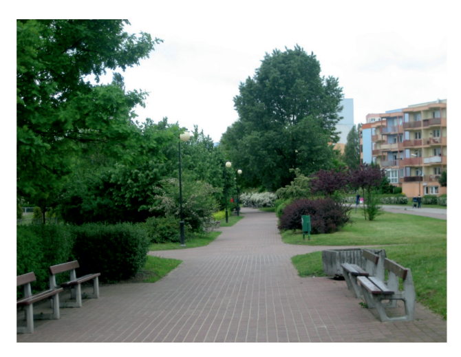
Picture 6. The same strategy applied elsewhere in Widzew. Perfectly-lit path in the park, while people should meet in the line of sight of dwellings with ground floor and first story apartments