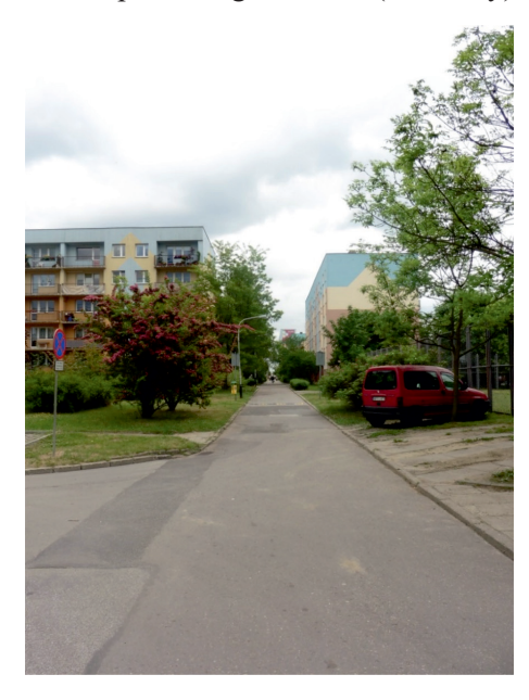
Picture 7. Good visibility, suitable material in the heart of the neighbourhood

The route should not be lit. Instead, a better connection between two isolated neighbourhoods should be found – Picture 7. Its positive aspects comprise its maintenance and daytime attractiveness of the place for pedestrians (Attractiveness) – Picture 8. Unfortunately, at night-time, the elderly are unable to cross this route due to the prevailing darkness (Visibility).