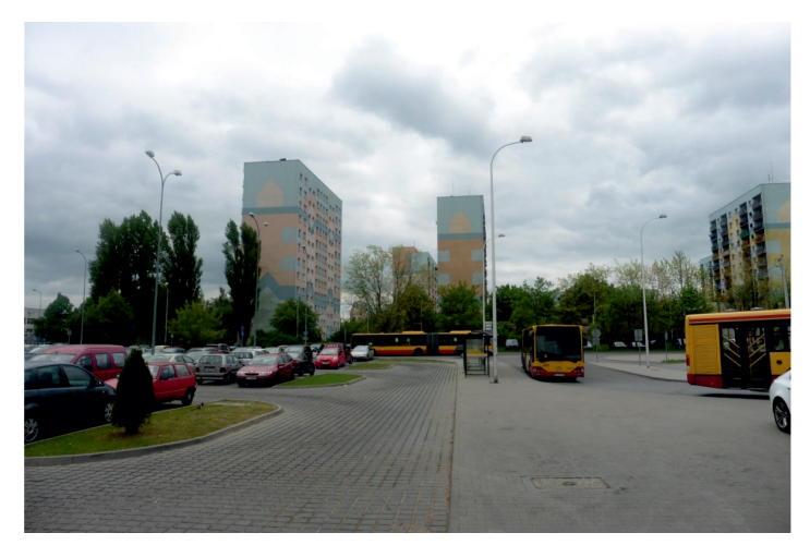
Picture 1. No "social eyes" in the neighbourhood of dwellings: other choices for orientation have been made

Following and addressing VATA we can observe: Arriving by bus or train, we have to move to the high-rise, the place where most people live. It is far away and the blocks are oriented so that the apartments get the sun from the south and the kitchens are on the cooler northern side. Much can be said about this choice, but a person can wonder why there are no windows at the side of the station and the routes to the apartment blocks. Indeed, there are none. It would be good to have "social eyes" closer by the station than it appears in the status quo (Visibility) – Picture 1.