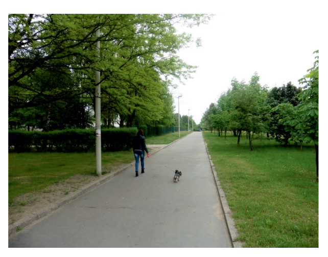
Picture 5. A well-lit lane in the middle of nowhere. Why should people be encouraged to go into the park, where no-one can see them (absence of "social eyes") and there is little chance for help when in danger? The route should not be lit, instead a better connection between the two isolated neighbourhoods should be found

However, it all changes when the school suddenly appears halfway through the neighbourhood. It was created somewhere in the middle of a direct roadway in the early years of the 21st century, while the routes take a turn and vanish out of sight of dwellings. This results in a well-lit lane in the middle of nowhere. Why should you encourage people to go into the park, where no-one can see you (the absence of "social eyes") and there is nobody to help when in danger (Visibility)? – Picture 5 and 6.