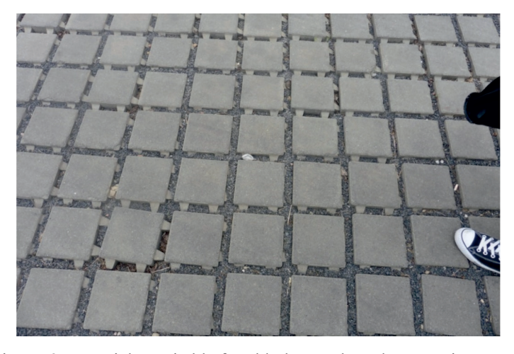
Picture 3. Material unsuitable for elderly people and women in general