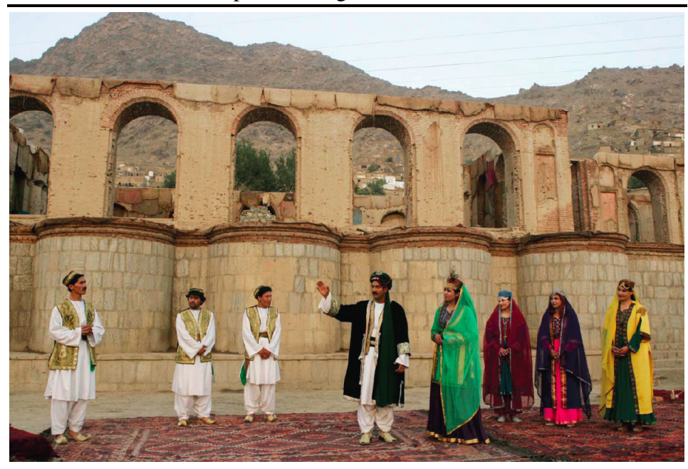
Fig. 1. Love's Labor's Lost in Afganistan.