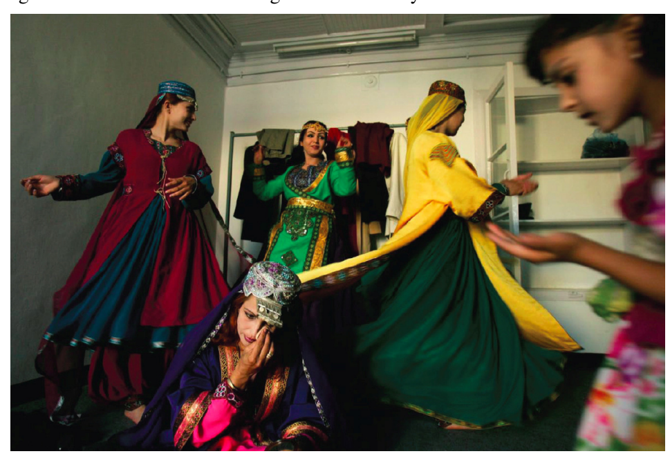
Fig. 4. Love's Labor's Lost in Afganistan.