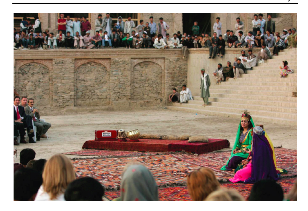
Fig. 3. Love's Labor's Lost in Afganistan.